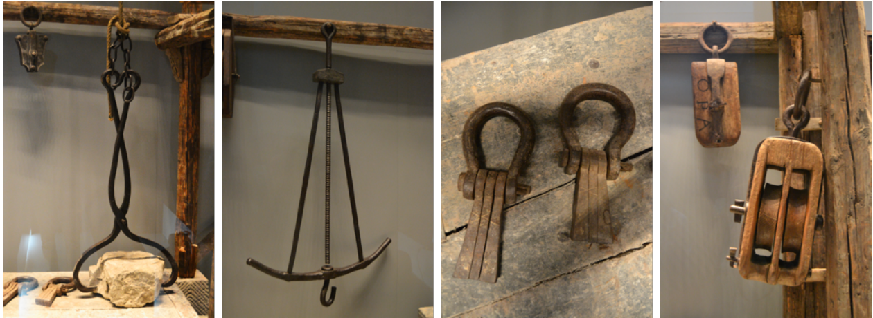
Fig. 1. Historical tools displayed in the Museo dell'Opera del Duomo. From the left: pincers, turnbuckles, three-legged lewis, pulleys.

on the drum, keeping the structure stable in all the construction phases [1];