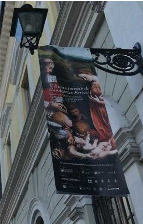
Fig.2. Visual advertisement of the diffused exhibition in Vercelli and in Torino, the regional capital.