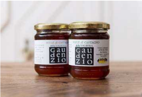
Fig.7. Honey from Apicoltura Sategna.

The project of the diffused art exhibition introduced in this paper is