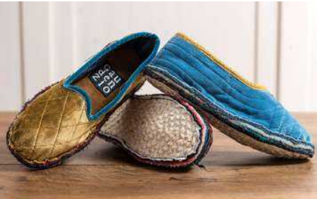
Fig.8. Scapin, a traditional local footwear, is realized in a special version as a tribute to Gaudenzio Ferrari.

skills and becoming unique colourful bags and pencil cases. The products can be currently bought in local thrift shops. These signs are clear evidence that the exhibition has been a driving force for the enhancement of local activities and related economies, even if with limitations and, in some cases, limited results. These effects are qualitatively important to accentuate the sense of belonging of the citizens to the entire process, the cooperative atmosphere between those who participated, and the perception of unity. The long-term goal revolves around the will of perpetuating these feelings and positive vibes, even after the temporal and spatial end of the exhibition.