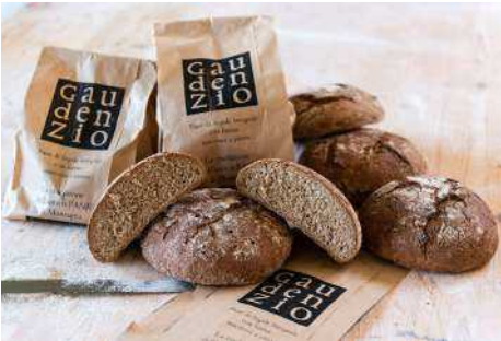
Fig.6. Traditional bread produced by the local bakery Il panificio di Varallo.

In qualitative terms, the exhibition has been the pretext to revitalize a decentralized area of Piedmont, through a carefully planned cultural operation aimed at discovering more about an extraordinary artist of the past. Furthermore, it has been an occasion to foster the collaboration between contributors and beneficiaries and to create powerful work groups that could cooperate side by side toward common shared goals, even in the future. Undoubtedly, quantifying direct