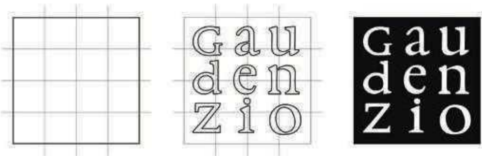
Fig.1. Design phases of the logotype.

Starting with a selection of the most representative paintings to advertise each venue, the design team came up with a range of graphic products, intended not only for the exhibition, but also for promoting the territory. The logotype Gaudenzio is designed to be reminiscent of a personal seal and can be inscribed in a square (Fig.1). The use of the sole personal name and the hyphenation of the syllables imparts a strong and unusual identification. By insisting on the facility of pronunciation and informal communication, the intent was to ideally shorten the distance between the artist and its audience. The dark background is in strong contrast with the white lettering, resulting from an analysis of the irregular serif typefaces, typical of the 16th century. The body copy, the advertisement (Fig.2), the banners and other visual artifacts were designed to attract people toward