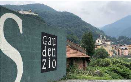
Fig.10. The large-scale reproduction of the logo Gaudenzio painted on a wall at the entrance of Varallo.

a valuable experiment for the design community. The event attempted to act on several levels by rethinking design as a multifaceted, multifold activity of thoughts and actions that are combined together. The observed impacts have certainly left positive traces in terms of a fertile terrain for the future growth of other initiatives.