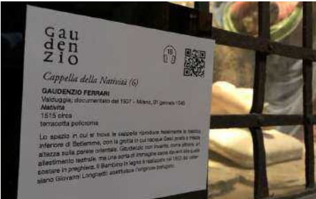
Fig.9. One of the explanatory plaques situated in front of a chapel at Sacro Monte di Varallo.

and indirect impacts on territories and economies could be challenging. More detailed mapping of the reverberations of the event is still ongoing and will require the expertise of economists, sociologists, engineers and institutions to assess socio-economical macro results in the short, medium and long terms. The analysis will include a comprehensive report of the products sold, the revenues and the percentage of local GDP increase. The evaluation will be conducted together, but not exclusively, with local shops and producers, and will include face-to-face interviews and surveys, in order to define other possible influential KPIs. Further joint academic research on the role of design for territories would be desirable. However, it is of primary importance to continue creating and strengthening relationships between stakeholders, inculcate new processes and motivations for territories and municipalities to collaborate for the benefit of the region. A periodical update of the Gaudenzio App could transform it into the driving force for the promotion of local areas, aside from the specific event it was originally designed and published for.