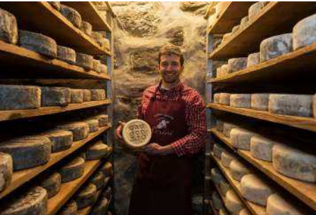
Fig.5. The producer Cerini Farm showing the Gaudentian toma.