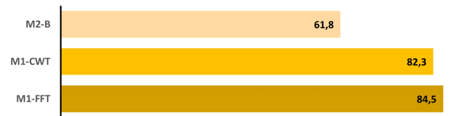
(b) LOPO validation.