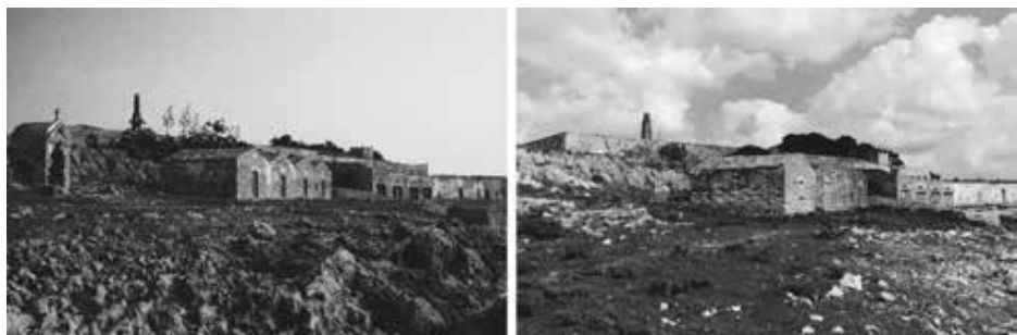
Figure 5 - Tonnara of San Vito Lo Capo, diachronic comparison. On the left: 1987, © Ernesto Scevoli/Studio Camera. On the right: 2018, © Mauro Fontana.