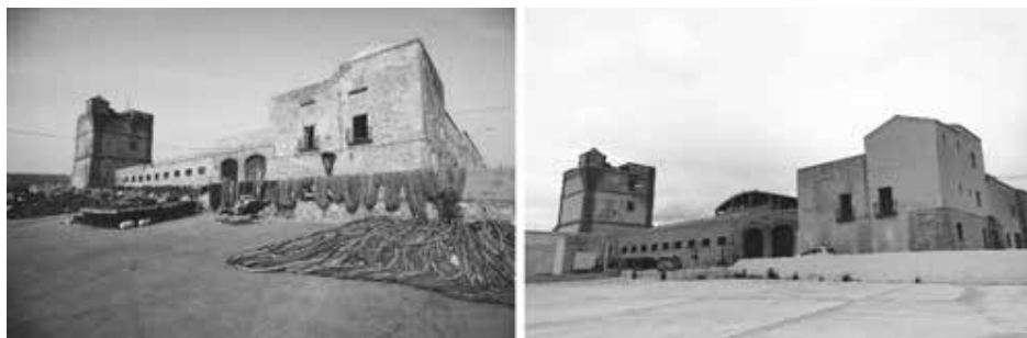
Figure 4 - Tonnara of Bonagia, diachronic comparison. On the left: 1987, © Ernesto Scevoli/Studio Camera. On the right: 2018, © Mauro Fontana.

In fact, photography always chooses what to show, sometimes forcing some views and preferring them over other ones. If in 1987 it was right to focus only on the divestiture in progress in a "romantic" way, today we must give photography a different role: it must become a language to discover, know, represent and understand the complexity of reality without constraints and aesthetic-formal obsessions, without hiding or removing parts.