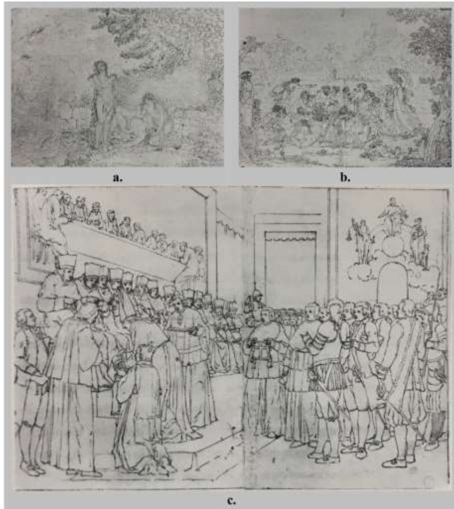
Fig. 3. Drawings by Gagneraux: a. Ante 1783, Adam et Eve pleurant sur le corps d'Abel , pen and black ink on paper, 350x260 mm, Musée des Beaux Artes, Dijon [33]; b. Ante 1782, Le festin des dieux champêtre , pen and black ink on paper, 521x697 mm, Gabinetto Disegni e Stampe degli Uffizzi, Firenze [33]; c. 1787 circa, La cérémonie du jeudi-saint , black ink and carcoal on paper, 360x530 mm, Musée des Beaux Artes, Dijon [33].

The peculiarity of these representations is also reflected in many original drawings by Gagneraux, that confirm his graphic intention, describing a possible transformation over time, from a sign still looking at the natural context (Fig.3a), (Fig 3b) to a sign probative of the simple physicality of a predella (Fig. 3c).