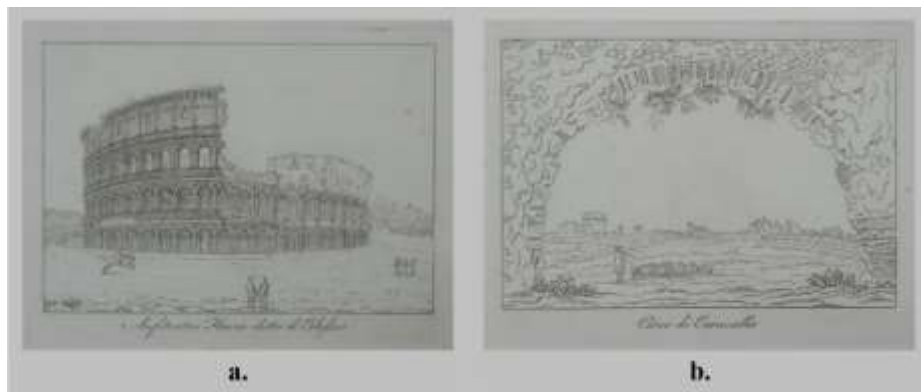
Fig. 5. GBC, examples of disegno in contorno (outline drawing): a. Colosseo , vol. 1, f. 5r; b. Circo di Caracalla , vol. 1, f. 23r.

His experimentation starts from vedute characterized by a light, almost air, graphics [14]. In such occasions, however, the attempt to simplify the graphical 'act' does risk falling into a semantic contradiction of superabundant signs describing buildings, for example in the case of the view of the Basilica di S. Pietro (Fig. 6a). This kind of experimentation arrives at representations where the difficulty of rendering the infesting vegetation on ancient ruins becomes a pretext to bring up the pure volumes of the building masses, as in the case of the Bagni di Paolo Emilio (Fig. 6b).