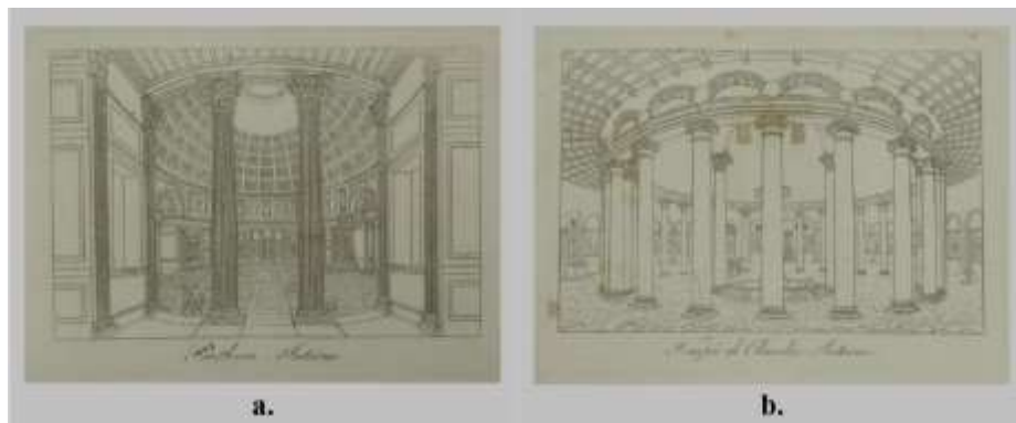
Fig. 7. GBC, examples of disegno in contorno (outline drawing): a. view of the hall of the Pantheon , vol. 2, f. 4r; b. view of the interior of the Tempio di Claudio , vol. 2, f. 42r.

Here, I bring for example the views of the hall of the Pantheon (Fig. 7a) and of the Tempio di Claudio (Fig. 7b). In both cases, it is evident how GBC manages to make the architectural space of the two interiors clearly legible without using chiaroscuro and contrasts but using only lines. Obviously, these views are quite rigid, but, in their small dimensions, fully embody the severe taste of neoclassicism based on Winkelmann's aesthetic theories. And, again, the view of the Tempio di Claudio takes this concept to its extremes by placing at the center of the picture not the intercolumniation, but the column; this vertical element is the base of the rigorous symmetry of the image produced GBC.