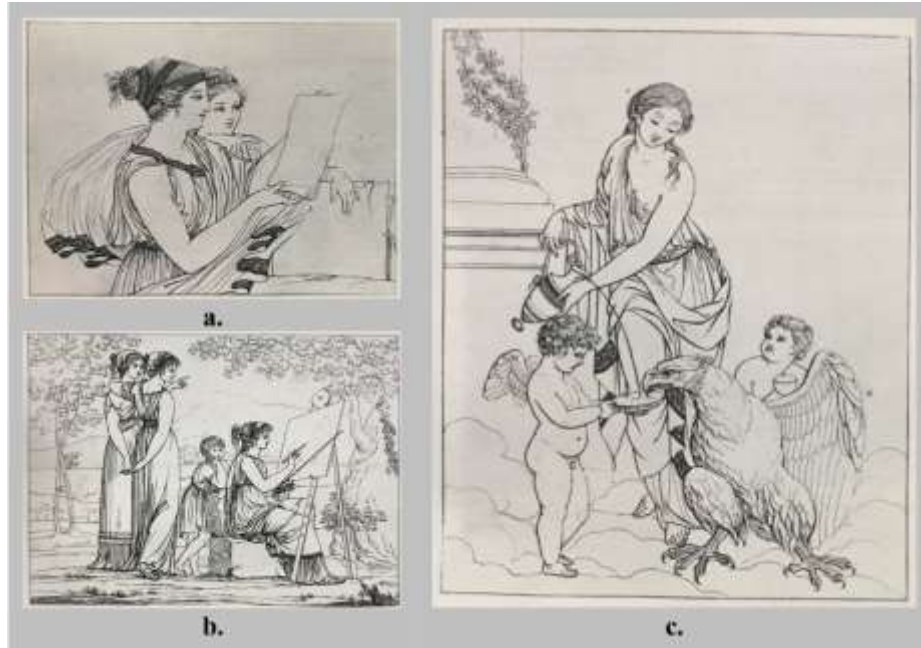
Fig. 2. Engravings from the Dix-huit estampes au trait , Musée des Beaux Artes, Dijon: a. Portrait des deux filles de M. Le Comte de Sellon. De Genève , 115x157 mm [33]; b. La peinture , 132x178 mm [33]; c. Hébé , 196x156 mm [33].

interpreter of this formulation of communication: as early as 1778 the sculptor Jean Jacques Larmarie claimed that «drawing is all in the stroke» [30].