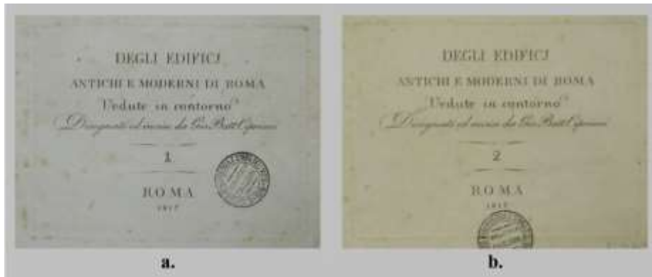
Fig. 1. Frontispieces of the two volumes of Vedute in contorno : a. , vol. 1, f. 1r; b. vol. 2, f. 2r.

The research exposes the results of part of my doctoral thesis related to the analysis of the collection of prints Degli edificj antichi e moderni di Roma. Vedute in contorno , by the architect, draftsman and engraver Giovanni Battista Cipriani (hereinafter GBC), published in Rome, starting from 1817 (Fig. 1a, b).