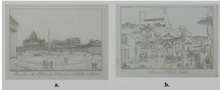
Fig. 6. GBC, examples of disegno in contorno (outline drawing): a. Basilica di S. Pietro in Vaticano ed Obelisco Egizio , vol. 1, f. 61r; b. Bagni di Paolo Emilio , vol. 1, f.18r.

Here, I bring for example the views of the hall of the Pantheon (Fig. 7a) and of the Tempio di Claudio (Fig. 7b). In both cases, it is evident how GBC manages to make the architectural space of the two interiors clearly legible without using chiaroscuro and contrasts but using only lines. Obviously, these views are quite rigid, but, in their small dimensions, fully embody the severe taste of neoclassicism based on Winkelmann's aesthetic theories. And, again, the view of the Tempio di Claudio takes this concept to its extremes by placing at the center of the picture not the intercolumniation, but the column; this vertical element is the base of the rigorous symmetry of the image produced GBC.