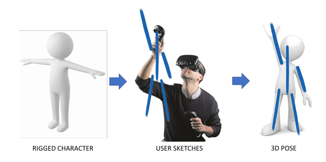
Figure 1: Expected use of the proposed system.

Another disadvantage of the solutions proposed in the literature is the fact that they generally come as standalone applications. Hence, integration with common animation suites like Blender, Autodesk Maya, etc. can take place only in a separate step of the animation workflow, thus making the process more tricky. The design reported in this paper considered the aspect above, and devised the system as an add-on for Blender. The aim of the proposed sketchbased system is not to replace Blender, but rather to offer an alternative interaction means that