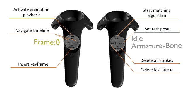
Figure 3: Functionalities available through the controllers.