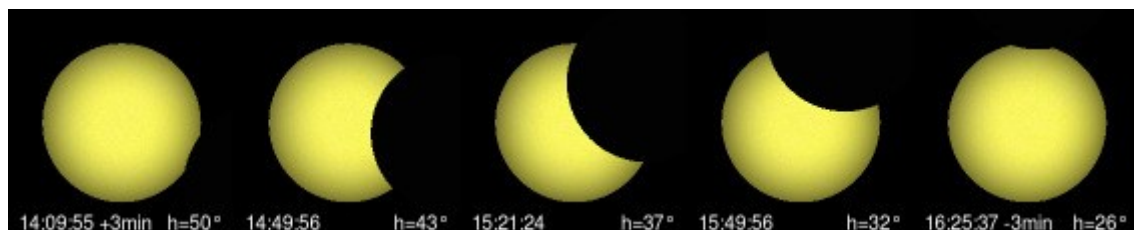
Figure 1: Graphical chart of the partial eclipse of 203 BC seen from Cuma. “At Cumae the orb of the sun seemed diminished”.

As we did in [7], for the study of the lunar eclipse of Alexander, let us use software CalSKY, a web-based astronomical calculator, created by Arnold Barmettler, University of Zurich. Let us use Cuma (Bacoli) as location to observe the eclipse. We find that on 6 May 203 BC, we had a Partial Solar Eclipse, Saros-Number: 54, Obscuration=37.070%, Altitude=37.4°, Azimuth=257.3° WSW, Duration of eclipse=2h16m, ET-UT=12809.7sec. The software gives us also the possibility to have a graphical chart, here shown in the Figure 1.