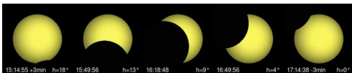
Figure 7: Graphical chart of the partial eclipse of 217 BC seen from Arpi.

One of the omens was the eclipse seen in Arpi, near Foggia. So let us use CalSKY for that location. We have the following eclipse. 11 February 217 BC: Partial Solar Eclipse, Saros-Number: 56, Obscuration=60.995%, Altitude=8.8°, Azimuth=240.6° WSW, Duration of eclipse=2h00m, ET-UT=12984.8sec.