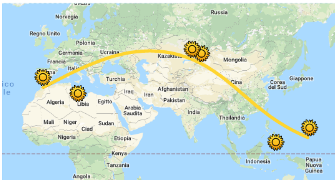
Figure 5: Thanks to CalSKY we can also see the path of the solar eclipse of 188 BC.