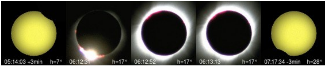
Figure 3: Graphical chart of the total eclipse of 188 BC seen from Rome.