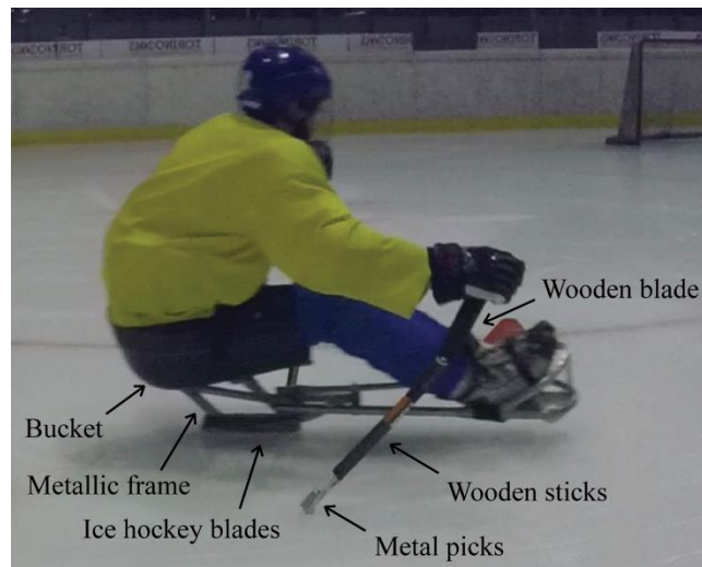
Figure 1. Para ice hockey player's equipment. Athletes play sitting on a sledge, which is made of a metallic frame and a bucket. The sledge is mounted on a couple of ice hockey blades and the bucket may be equipped with a backrest and a cushion. Straps are used to secure athletes to the sledge. The propulsion is obtained by a couple of wooden sticks.