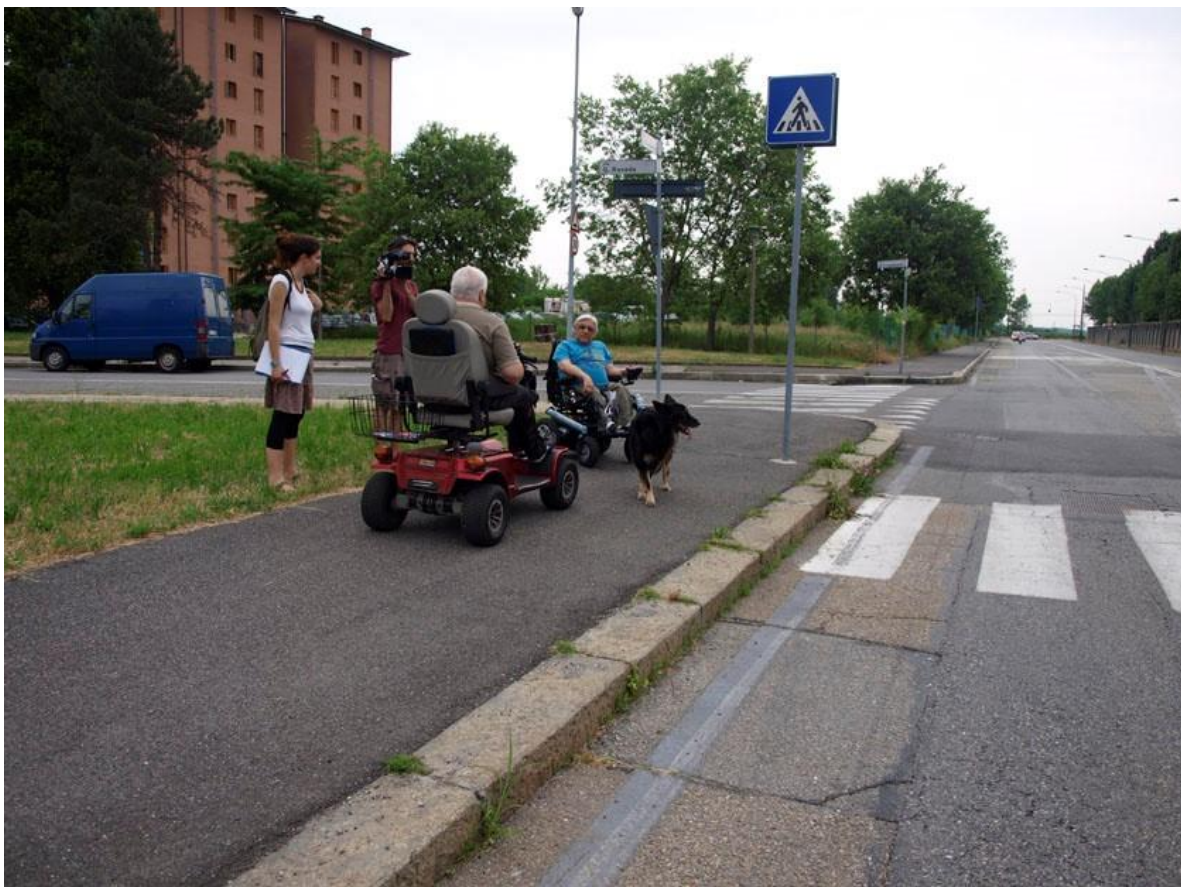
Fig 2. The transect walks.

4. Training. With the support of the Fondazione della Comunità di Mirafiori Onlus, a group of 30 inhabitants was selected for collecting data on the area, and stimulating the 'crowd-mapping' effect. The students, the researchers, the PA with its technicians, the Fondazione Mirafiori non-profit organization and the associations - all together - have participated in some programmed "listening" moments.