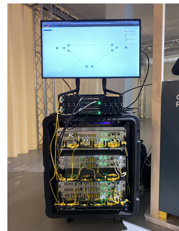
Fig. 2: Hardware setup at the TIP Summit