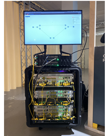
Fig. 2: Hardware setup at the TIP Summit