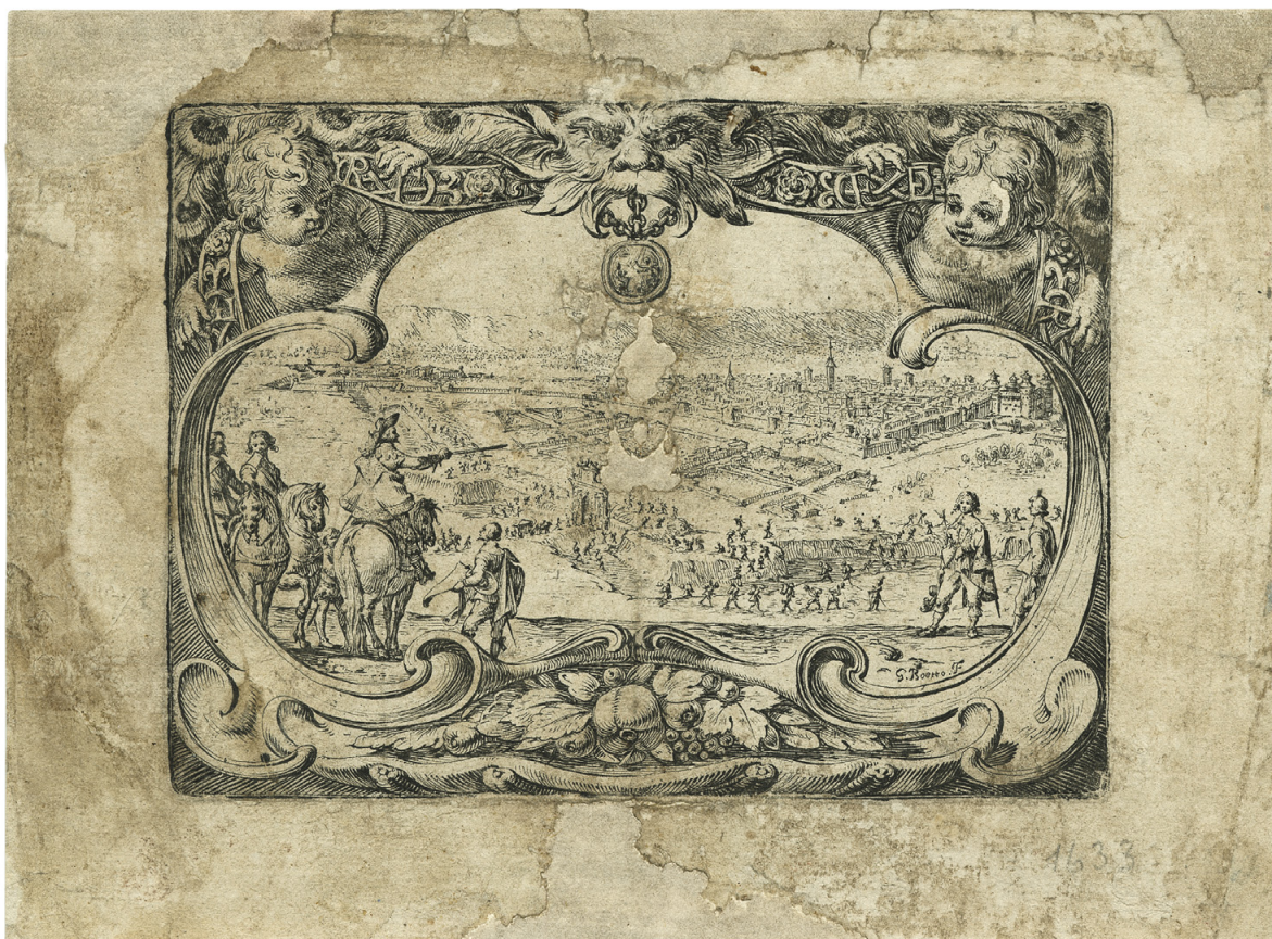
FIG. 5 GIOVENALE BOETTO, Vittorio Amedeo I e Carlo di Castellamonte sovrintendono alla nuove fortificazioni di Torino , 1633, engraving. Turin, Archivio Storico della Città di Torino, Collezione Simeom, D 142.