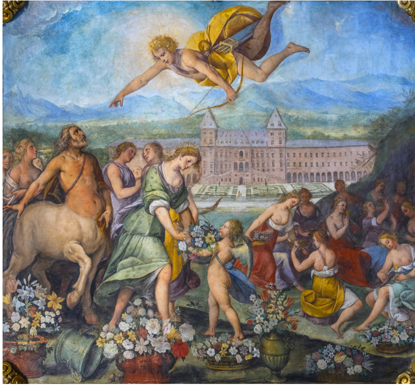
FIG. 1 Vault of the Valentino Room. Valentino Castle, Turin, Cristina of France, dressed as Flora, goddess of Spring.

San Carlo and Santa Cristina, were built like two stage wings to frame the entrance of the southern section of Contrada Nuova (now Via Roma). The convent annexed to Santa Cristina, now demolished, was home to the Discalced Carmelite nuns, summoned to Turin by Cristina who chose their monastery for her spiritual retreats. Carlo di Castellamonte, superintendent of all the ducal sites, was the architect of the urban project which was based on Vitozzi's plan.