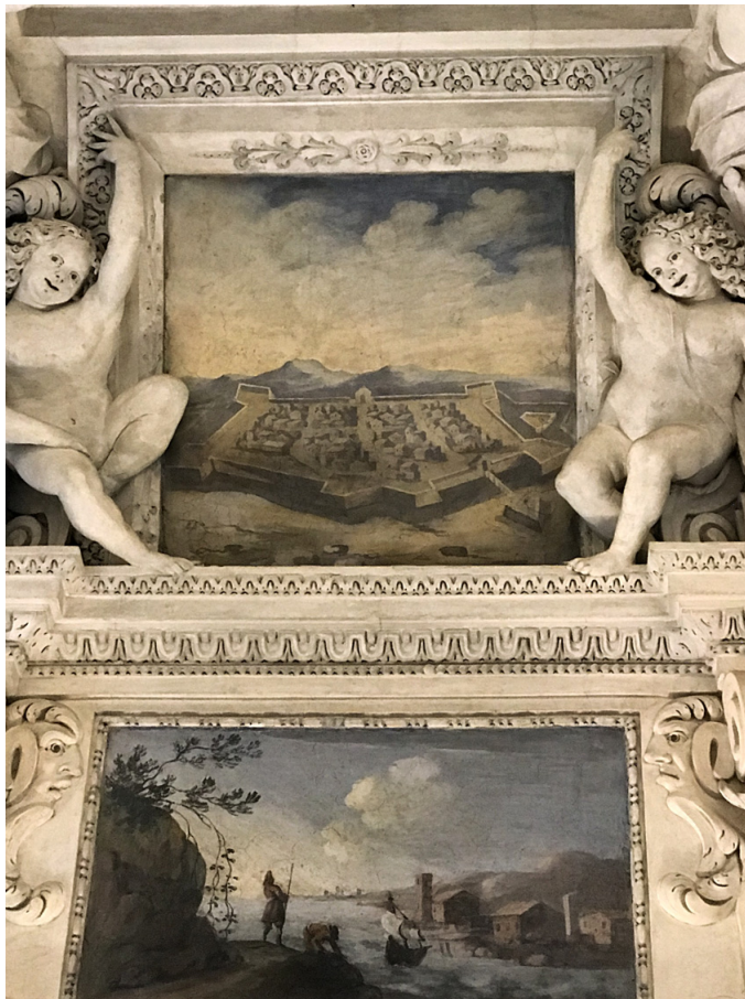
FIG. 4 Room of Magnificence Valentino Castle, Turin. Detail of stucco and fresco decoration.

with the large courtyard by an atrium whose space was punctuated by six Doric columns holding up the large hall on the main floor. At the time, access was gained to the atrium from the river by two ramps, leading to the «imperial staircase» rising up to the upper loggia and the hall.