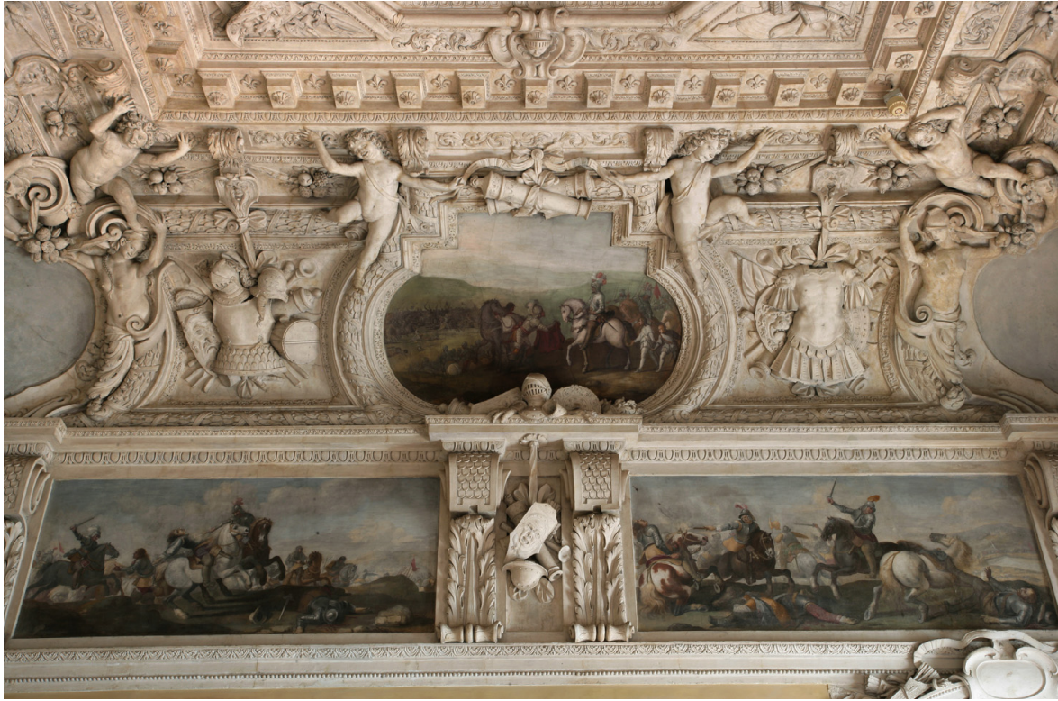
FIG. 2 War Room, Valentino Castle, Turin. Detail of stucco and fresco decoration.

The seventeenth-century renovation of the Valentino palace was split into two phases: from 1620-1623 the wing parallel to the river was defined, flanked by two towers; after 1645 the two lower pavilions were created, linked to the main wing by two porticoed and terraced tunnels on just one above-ground floor, and the closing hemicycle of the courtyard. Valentino was designed according to the French pavillon-système , closely related from a distributive point of view with the river: the main view, towards the hill, was linked