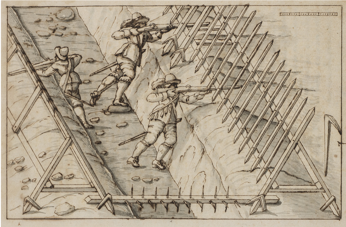
FIG. 9 CARLO DI CASTELLAMONTE, Detail of the manuscript Le trinciere . Turin, Musei Civici, Torino, 2698/DS.

welcome him, accompanied by Carlo di Castellamonte. These were crucial days for the Duchy: the heir to the Savoy throne, little Francisco Giacinto, was seriously ill. Cristina had taken over from Vittorio Amedeo I as head of state, but the attack launched by Spain seemed incontainable: in the spring of 1638 the troops of the Marquis of Leganés, governor of the state of Milan, besieged the Savoy fortress of Breme, which was strategic for the control of the border towards Novara and Pavia. After capitulation, attention moved to Vercelli: in May 1638 the Spanish army crossed the river Sesia and laid siege to the city, which surrendered on 4th July. The Duchy was also under attack from the east; the French allies occupied Pinerolo just a few kilometres from the capital and did not hide their desire to reduce the Duchy to a protectorate. The governor of the state of Milan found a strategic ally in Prince Tommaso: the two armies were to succeed in bringing down several Piedmont towns, subtracting them from Savoy control in what would go down in history as the «notable campaña». For the Piedmontese, management of the strongholds on the borders, towards France and towards the state of Milan, proved to be even more crucial for security; the Spanish were to arrive at the gates of Turin, which would then suffer two different sieges, in 1639 and in 1640, and which would remain unconquered due also to the sturdiness of the fortified walls and the citadel.