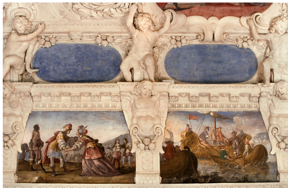
FIG. 3 Negotiations Room, Valentino Castle, Turin. Detail of stucco and fresco decoration.

The seventeenth-century renovation of the Valentino palace was split into two phases: from 1620-1623 the wing parallel to the river was defined, flanked by two towers; after 1645 the two lower pavilions were created, linked to the main wing by two porticoed and terraced tunnels on just one above-ground floor, and the closing hemicycle of the courtyard. Valentino was designed according to the French pavillon-système , closely related from a distributive point of view with the river: the main view, towards the hill, was linked