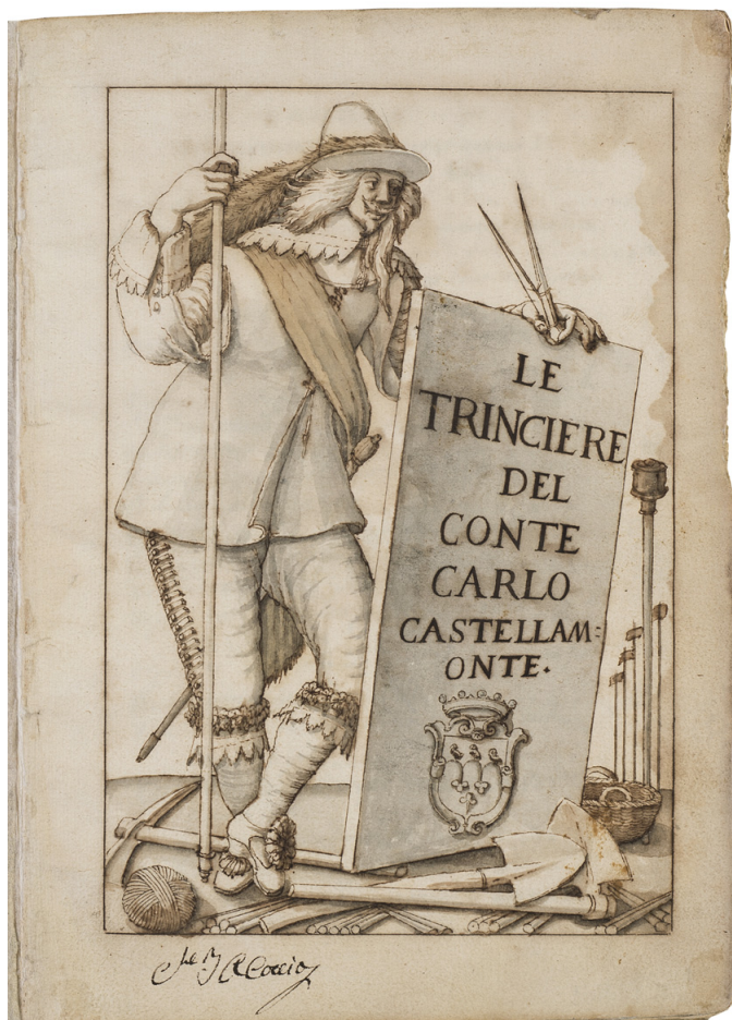
FIG. 7 CARLO DI CASTELLAMONTE, Le trinciere (frontispiece) di Carlo di Castellamonte. Turin, Musei Civici, Torino, 2698/DS.

It is unlikely that the fourteen-year-old Cristina, who arrived in Turin as the new bride of Vittorio Amedeo I, had acquired any skill in military strategy as a child in France. It is more probable that, alongside her husband, the crown prince who from 1630 was the ruler, she was able to attend meetings with Carlo di Castellamonte and with the other military engineers of the Duchy, in this way learning the correct terminology and the rudiments of the art of fortifying. In the first half of the seventeenth century, many drawings were preserved within the great gallery of the royal palace, and are today stored in the State Archive of Turin in the five volumes of Military Architecture 17 . These are 576 maps drawn or acquired for Duke Emanuele Filiberto and for Carlo Emanuele I for the various purposes of government (for example defence and espionage). Dukes and military engineers were trained on these maps; Vittorio Amedeo I (1587-1637) was certainly among them. Cristina's future husband also spent some years of his infancy in Madrid with his two brothers Filippo Emanuele (1586-Madrid 1605) and Emanuele Filiberto (1588-1624). The three young princes, sons of Infanta Catalina Micaela of Spain, the