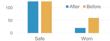
Fig. 3. Classes distribution across the dataset.

used (a run is equivalent to a single working) and each run takes place in a particular time. The values of the last six features are not shown because in each cell there is a multidimensional array corresponding to the analog measurement of the sensors: it is necessary apply a feature generation to transform these multidimensional arrays in a set of mono-dimensional data. The setup of the experiment is as depicted in Fig. 2. The basic setup encompasses the spindle and the table of the Matsuura machining center MC-510V. An acoustic emission sensor and a vibration sensor are each mounted to the table and the spindle of the machining center. The signals from all sensors are amplified and filtered, the fed through two RMS before they enter the computer for data acquisition. The signal from a spindle motor current sensor is fed into the computer without further processing. So, in this way, the experiment design provides 5 sensors output.