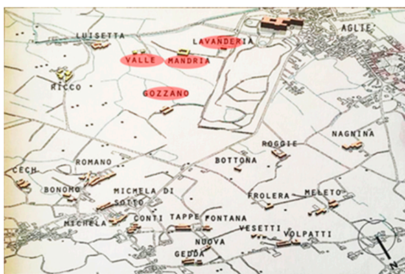
Figure 2. Cartography extrapolated from the Ancient Archive of Agliè Municipality (“Comune di Agliè”).

Cascina Ortovalle has been represented on historical maps since 1745. It is a single building with simple wings and was mainly used for cultivations of fruit and vegetables. The structure is located on a hill and can be accessed by a poorly maintained dirt road. The building is in good condition since it is inhabited. It has a large terrace looking into the countryside of Agliè and a wall surrounds it. The context in which Cascina Ortovalle is located is characterized by large cultivated fields and the structure is well connected to the city through the main road. Presently the building can be used on all stories, it is not at risk of collapse and it does not present a compromised crack pattern. The architectural structure has a large barn with a trussed roof, which was restored a few months ago by the current tenants of the building.