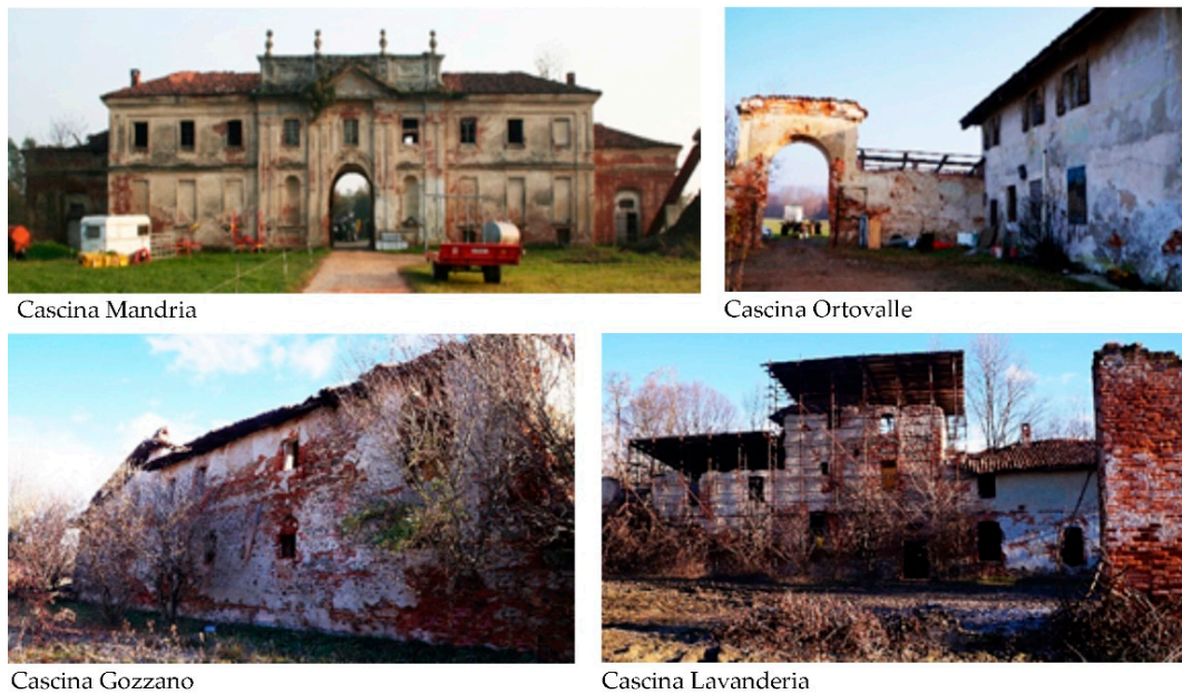
Figure 3. The farmhouses of the Aglié Castel.