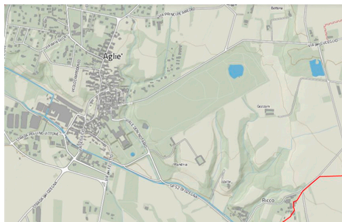
Figure 1. Cartography extrapolated from the geoportal representing the system of the Castle and ducal farmhouses, Municipality of Agliè, http://www.geoportale.piemonte.it/geocatalogorp .

Cascina Allea (called Mandria) was designed between 1772 and 1773, thanks to the drawings and instructions of Birago di Borgaro, at the service of the Duke of Chiablese [59]. This building is interesting mainly because of its location within the context of the Castle Park and the architecture of its façade. The complex is formed by a closed court organized around a quadrangular space. A U-shaped volume forms the structure and it has an axis of symmetry passing through the large entrance arch. The structure is composed of three main volumes. The structure does not appear to be in an advanced state of degradation but it is damaged by a lack of maintenance and by exposure to the action of atmospheric agents.