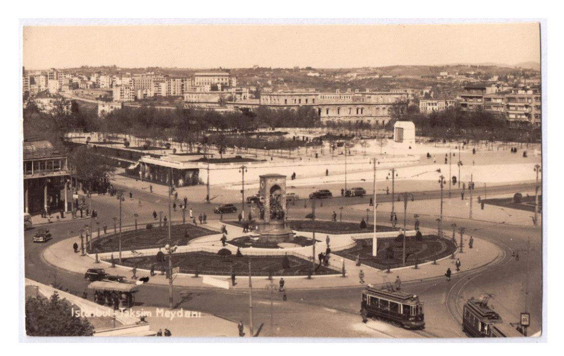
Figure 1. Taksim Square in 1940s<sup>2</sup>.

the social life through modern public spaces that did not exist in Ottoman traditional life. Achieving this aim has led to the shaping of Taksim – Macka Valley by integrating 'green spaces' with 'public buildings'. In other words, by supporting Taksim's existing public identity coming from the Late Ottoman Period, Prost prepared a plan for Taksim - Macka Valley (named as Plan Park No 2) by conceiving as a public park with continuous public functions. His plan was realized in the 1940s (see Figure 1). His vision made Taksim Republican Square as a modern city center of İstanbul. In addition, Gezi Park was formed to the place of demolished Topcu Barracks. The park became the first public park where women and men easily and freely could enjoy daily life together.