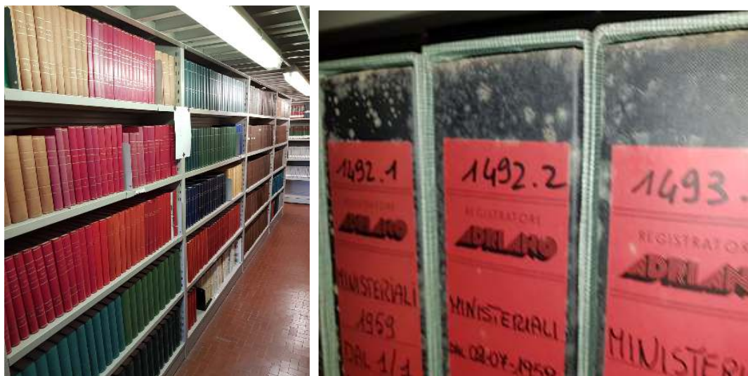
Figure 2. Department library

The case study refers to one of the department libraries at Politecnico di Torino, where the effect of heavy rains in autumn is bringing to an increase in the moisture exposure of the collections. The library has not a control system for the environmental conditions and some damages to the stored collection is starting. In Figure 2 a snapshot of the storage system – open metal shelves – and a detail of the mould growth is shown.