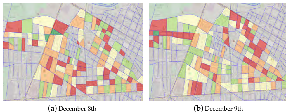
Figure 4. Average consumption per \text{m}^3 of the buildings in the monitored district, grouped by neighborhood.

The map reported in Figure 4 similarly provides the average consumption per \text{m}^3 , hence being useful to estimate the energy efficiency of the buildings. It is interesting to note that during the national holiday, even if the previously analyzed office neighborhood was green (0–20%) in total consumption (Figure 3a), it is orange (60–80%) in average consumption (Figure 4a), hence being poorly efficient when using low total energy. On the contrary, it has a very high energy efficiency on December 9th (Figure 4b) with a light-green level (20–40%), when it is a top consuming neighborhood (red level 80–100%, (Figure 3b).