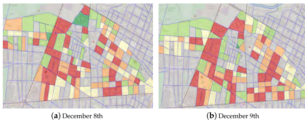
Figure 3. Total consumption of the buildings in the monitored district, grouped by neighborhood.

and expansion plan of the district heating networks, besides the day-to-day operations. In Figure 3, a district map of building consumption levels with real experimental data is presented for two different days, December 8th in Figure 3a and December 9th in Figure 3b. Each of the five consumption levels is a percentage range of the top consumption among the overall population for that day, and it is associated with a color from green (0–20%) to red (80–100%). The aim is to analyze the total consumption of each neighborhood in the district under exam, hence grouping together the single buildings but keeping a fine-grained spatial resolution. While such a map can be produced for any prediction horizon, the presented results describe a whole day consumption, considering that December 8th is a national holiday. Specific patterns emerge for residential versus office/public buildings; for instance, the two neighborhoods at the top-centre of the map had opposite behaviors: the lower one is green (0–20%) during the national holiday (Figure 3a) and red (80–100%) on the next day (Figure 3b), and indeed it is a neighborhood of office buildings. On the contrary, the upper neighborhood is red (80–100%) during the national holiday (Figure 3a), and light green (20–40%) during the next day, hence showing the behavior of a residential building with most people working out of home.