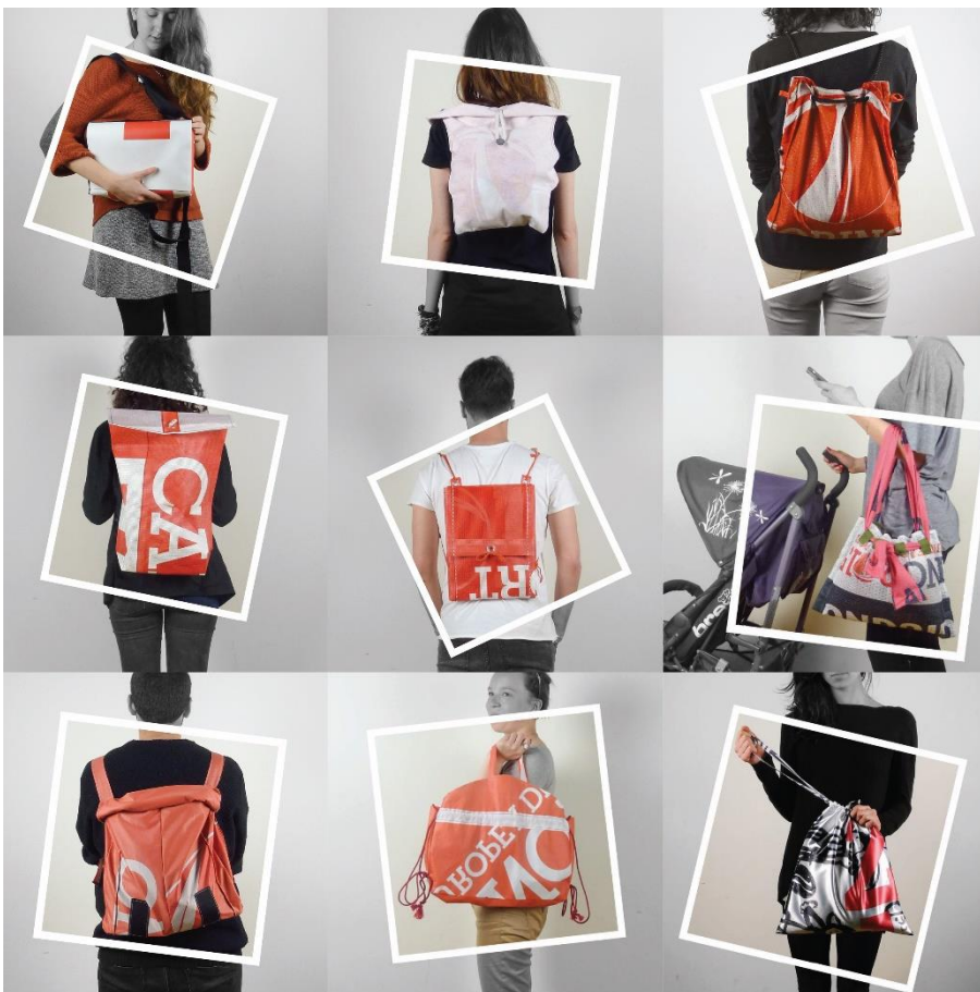
Figure 2. The projects by the students

The characteristic of the textiles explored by the students were organized in order to highlight specific performances in terms of the opportunities to design a series of bags. These clouds of performances/design opportunities, together with the definition of specific target users according to the description of Ingenio's clients - for example sporty mother with new-born, businessman, urban biker, skater, wheelchair-user - enabled the students to work on their design scenarios, creating a complex picture of the project's issues and defining the project question. According to this, each group of students carried out a new concept for different bags.