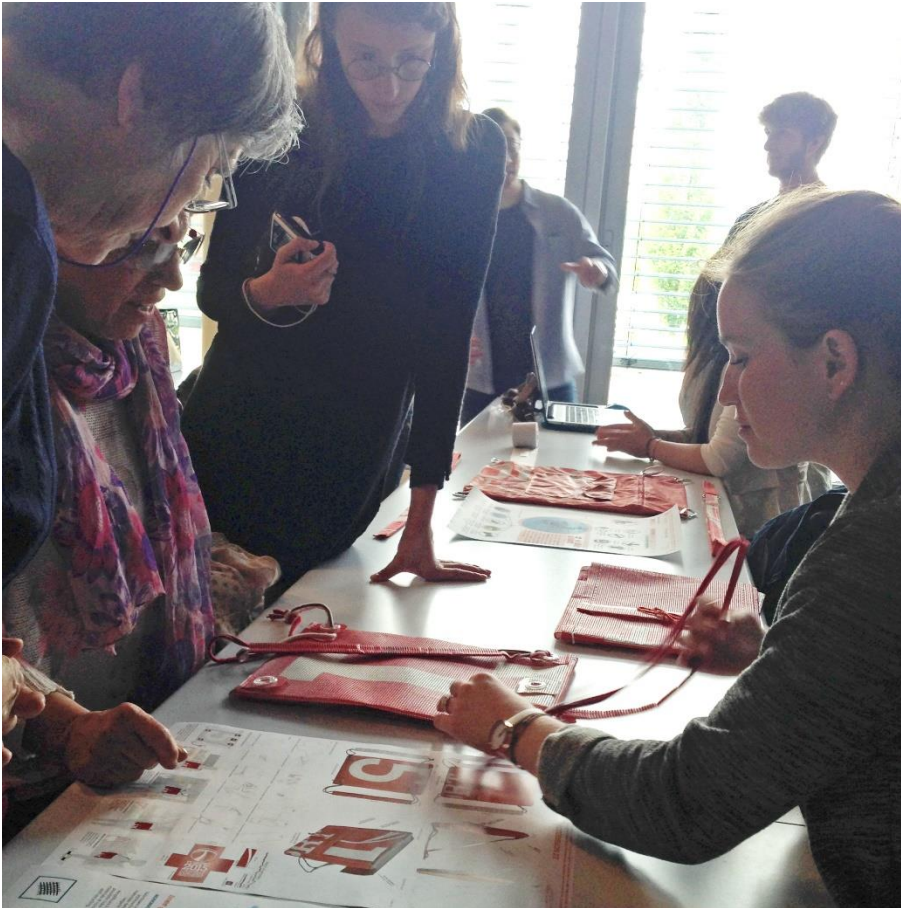
Figure 3. A student presenting the bag designed by her group to the representative of the laboratories during the show at Politecnico