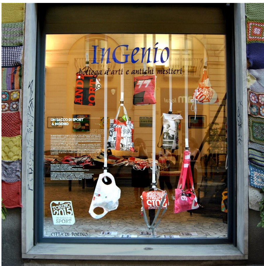
Figure 5. The windows display set up at InGenio's shop for the launch of the collection

The first collection of bags is currently on sale and Politecnico and InGenio are investigating the social, economic and creative impact of the project and the opportunity to rerun it. In this sense, some focus groups are being conducted both with representatives of the laboratories and with the students. The focus groups' goals are to identify weaknesses and strengths of this co-creation process in order to improve the experience for all the actors involved.