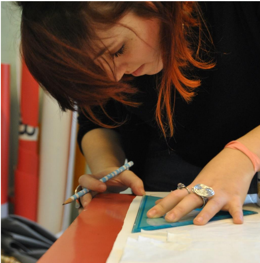
Figure 4. A student participating to the manufacturing process of the bag she designed in a social cooperative's sewing laboratory.

Moreover, textiles, paper patterns, stiches and needles acted as trigger for social cohesion: they were tools for the creation of a meaningful environment of cooperation and collaboration between the students and the vulnerable citizens involved as artisans.