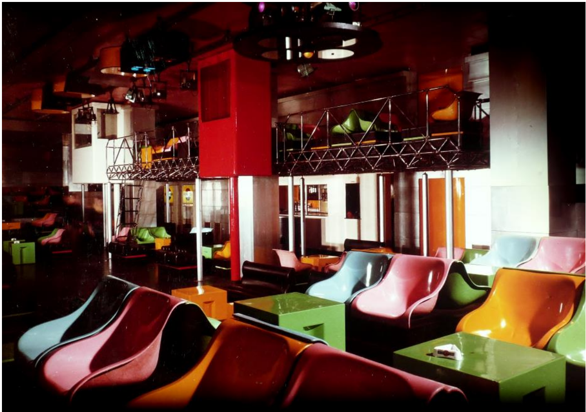
Fig. 5. Piero Derossi, Interior of the Piper nightclub, Turin, 1965

Superarchitettura (1966), the Piper nightclubs in Rome, Florence and Turin (from 1965 to 1967) [Fig. 5] or the Effimeri urbanistici by UFO (1968), not only featured objects and equipment inspired by the Pop culture that reflected new ways of living in homes and cities, they also laid the foundations for a challenge to the acclaimed relationship between design and the industrial system. The pillar of this new hybrid between architecture and design were the experimental companies located outside the mainstream industrialised sphere of the Lombard region. They embraced ideological positions on themes that challenged codified design approaches, the capitalist industrial system and the re-assessment of the craft industry, as well as the individual and emotional value of design, positions taken by many architects in the face of situations such as Global Tools 57 .