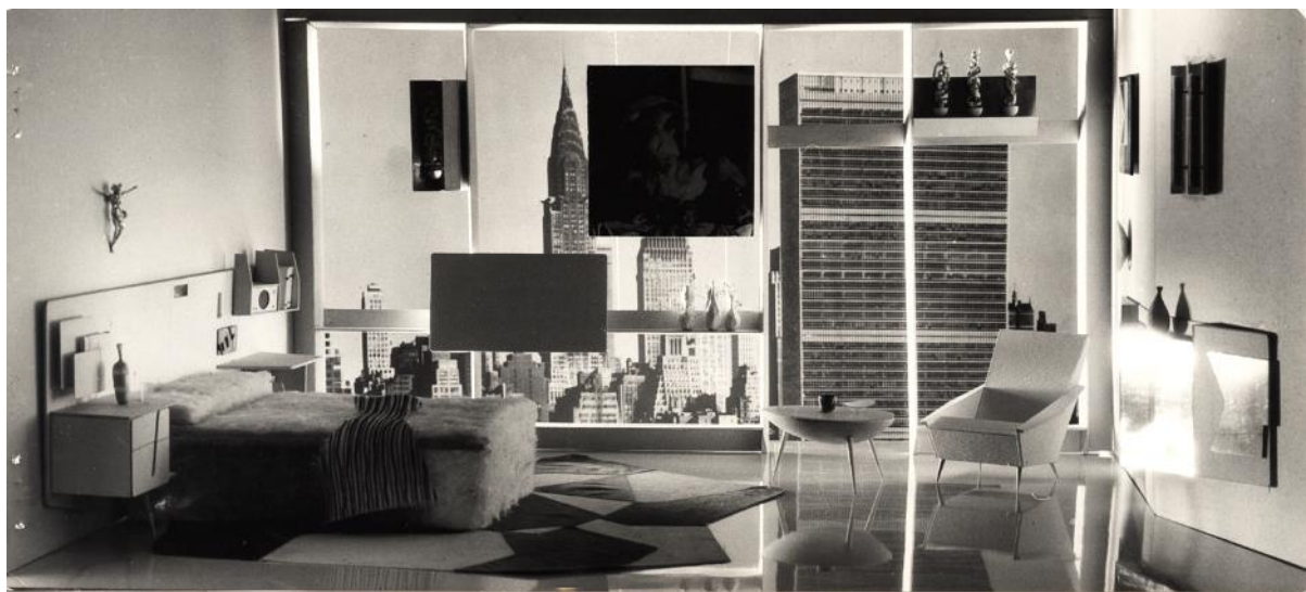
Fig. 2. Gio Ponti, La finestra arredata ( The furnished window ), X Triennale, Milan, 1954, produced later by Altamira Inc., New York, Gio Ponti Archives, Milan

In 1954, the “year of design”, which featured the above-mentioned conference, the Triennale exhibitions [FIGS. 2-3] including the Rassegna dell'industrial design (commissioned by Marcello Nizzoli, Roberto Menghi, Augusto Morello, Michele Provinciali, Alberto Rosselli, and designed by Achille and Pier Giacomo Castiglioni), the institution of the Compasso d'oro award promoted by La Rinascente and conceived by Ponti, and the foundation of Stile Industria magazine edited by Rosselli 36 , architects seemed to lead the development process of the design discipline 37 .