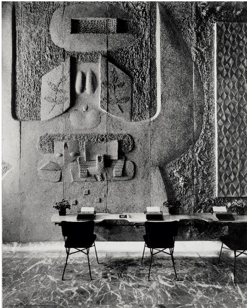
Fig. 3. BBPR, Olivetti Showroom in New York with relief by Costantino Nivola, 1954