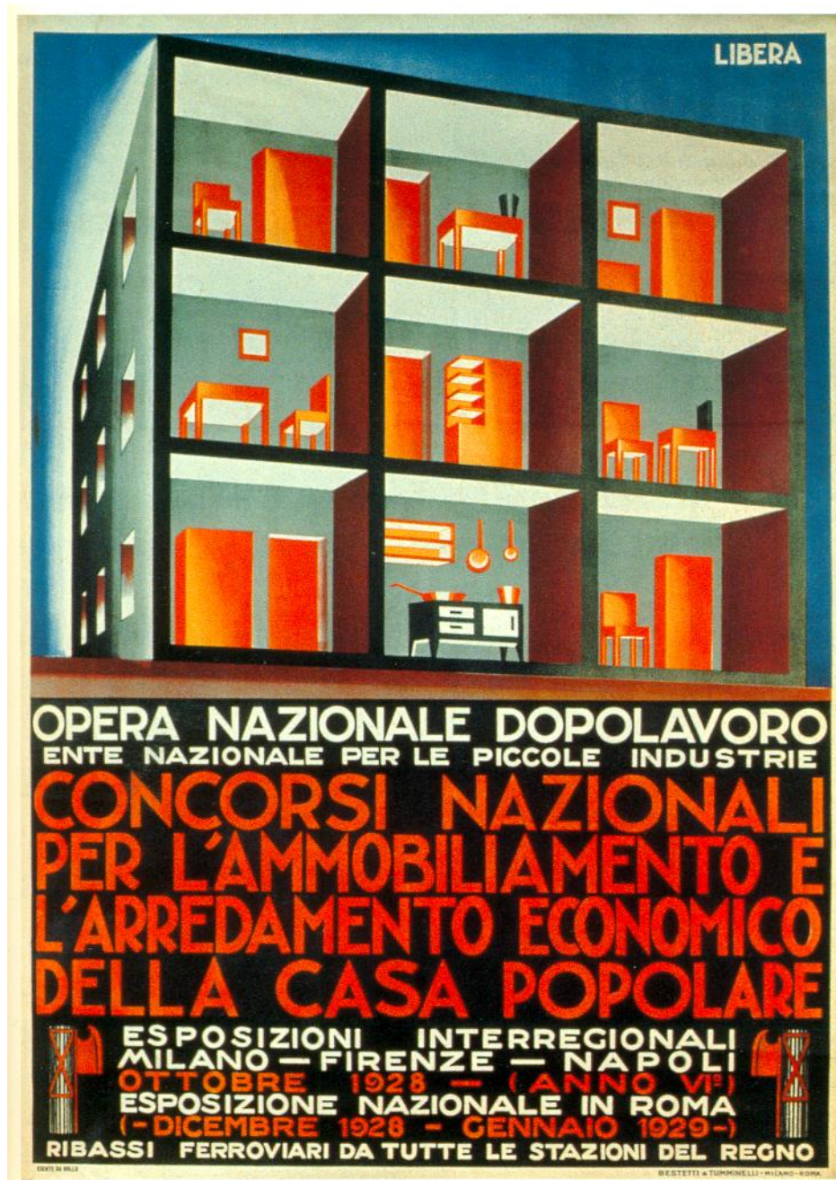
Fig. 1. Adalberto Libera, Poster for the Exhibition of the Results of the National Competitions for the Economic Furnishing , 1928, Private collection

of the 1936 and 1940 exhibitions in Milan 23 . On display were objects for domestic use, as well as engines, optical instruments and calculation devices, objects made of rubber 24 . If on the one hand, the debate surrounding design for mass production in the field of home furnishings, construction materials and processes had achieved full maturity in exhibitions, magazines and schools, there was a persisting degree of vagueness in the understanding of industry and design, in the relationship with the craft industry and other expressions of art and ideologies 25 at a time in Italian history characterized by strong contradictions that would culminate in Italy going to war shortly after the opening of the 7th Triennale.