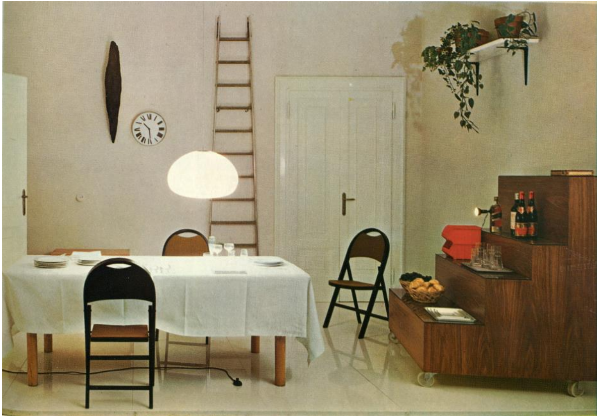
Fig. 4. Achille and Pier Giacomo Castiglioni, Room of the exhibition, La casa abitata ( The Inhabited House ), Florence, Palazzo Strozzi, 1965, Fondazione Archivio Castiglioni, Milan

The apparent straightforwardness of the two parallel paths (architect-designers and designer-designers), could not but be affected by the conditions created by the rapid growth in production and consumption, enabled by the low cost of labour: an increase in exports on the one hand, and warning signs of growing social tensions on the other. If one also considers how hard it was for young architects to break into their profession due to mass university schooling, or the new ideas deriving from the counterculture 55 and the introduction of the Beat Generation 56 artists and poets in Italy, it becomes obvious how the clarity of cultural instruments and methods that the separate disciplines of architecture and design considered to be shared and usable, in fact raises several issues of concern.