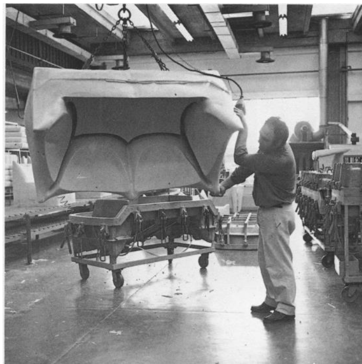
Fig. 8. Production of the Bambole sofa (Mario Bellini, 1972), B&B Italia, B&B Archives, Cantù (Como)

C&B, later to become B&B Italia, was also conceived as an industry: it was founded in 1966 in Brianza to develop Cesare Cassina and Piero Busnelli's idea for perfecting machines to cold-form polyurethane foam [FIG. 8]. This technology allowed designers such as the Afra and Tobia Scarpa, Mario Bellini or Gaetano Pesce to work at the Research and Development Centre on concepts for upholstered seating in a myriad of forms, devoid of rigid structural supports, made to accommodate the new attitudes arising in home living 89 .