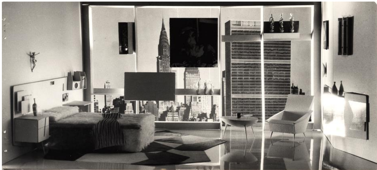
Fig. 2. Gio Ponti, La finestra arredata ( The furnished window ), X Triennale, Milan, 1954, produced later by Altamira Inc., New York, Gio Ponti Archives, Milan