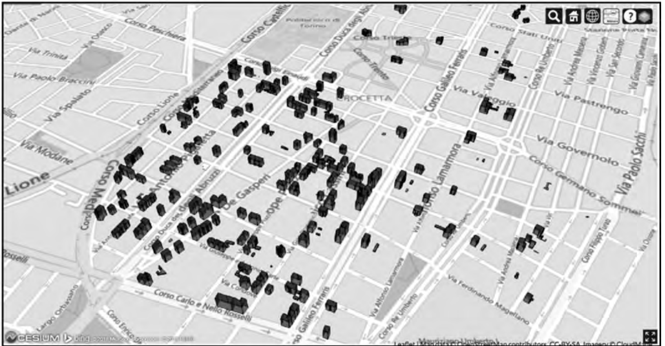
Figure 3 - The 200 buildings considered

More specifically, the article indicates the results of the second focus group; the stakeholders involved in that group were represented by the Association of Constructors of Turin and the Public Administration, Entrepreneurs, designers and experts/academics in the field of energy and economic valuations.