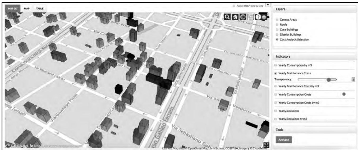
Figure 4 - Visualisation of the maintenance costs for some of the considered buildings

When considering Table 3 it emerges that the criterion deemed most important for the transformation of the “Crocetta” district is the “Investment Costs” (30%) followed by the “PBP” (27%) and the “Reduction of energy demand” (23%). The difference of importance in percentage terms between these criteria is minimal and mainly reflects a strategy of short-term private profit. The