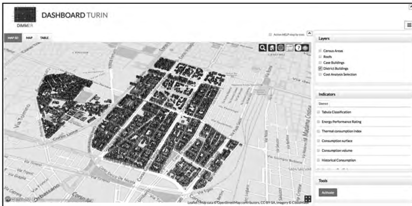
Figure 1 - Example of Dashboard interface