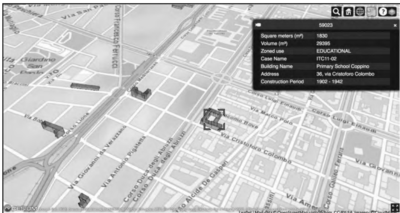
Figure 2 - Example of pop-up card

In particular, the CA developed considers: