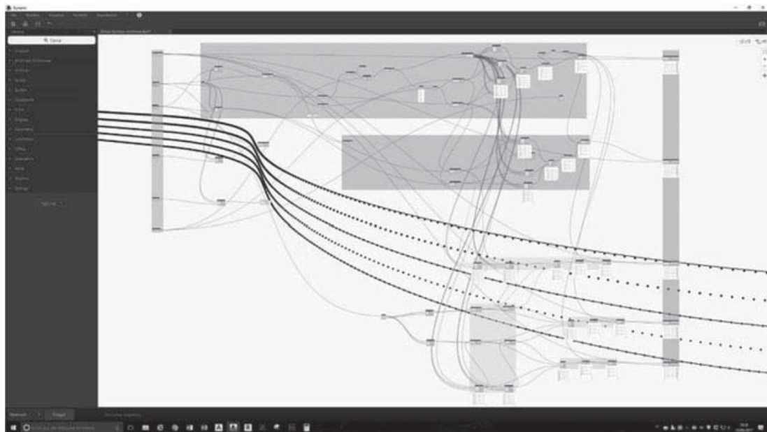
Fig. 3 Dynamo script of the ventilated façade

The curved ventilated façade is composed of a metal structure, linked by fixing brackets to the concrete wall. The metal structure, composed of t-shaped steel profiles, acts as support for the cladding, made of high-pressure compact laminated panels. To create a pattern, the script included four inputs: the face of the geometry, width of panels, height of the coloured central panels, and RGB colours for the random pattern. The use of an algorithm allowed the creation of an adaptive family, embedded with the required parameters; the adaptive components were then placed on located points. The extraction of quantities from the BIM model allowed some considerations related to shape, costs, number of modules, and waste materials. A multi-criteria approach, based on the needs of the contractor, was used to evaluate the most suitable solution. This approach is particularly useful as it implies a tailored solution, based on stated needs and on quantitative evaluations, enhancing control over decision processes.