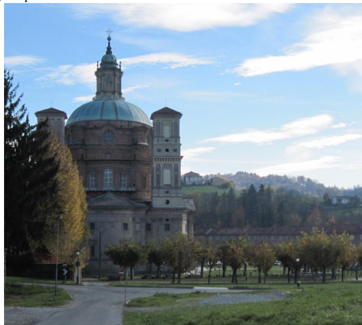
Figure 1. The shrine of Vicoforte (Regina Montis Regalis).

The need to enshrine ducal power and to strengthen the dynastic-territorial identity of the state was particularly important for duke of Savoy Carlo Emanuele I. Two of the most prestigious Piedmont shrines, Oropa and Vicoforte both dedicated to the Virgin Mary ( Figure 1 ), were built during his period as duke. The choice of these two sites was significant because they represent two different geographical areas of strategic importance in the Piedmont territory of Savoy: in the North, the Biella area, and to the South, the Monregalese. The Biella area was an important crossroads of the East-West routes that connect Lombardy and Val d'Aosta to Savoy. The Monregalese was a crucial core connecting route between Piedmont and Liguria. A veritable growth in the number of Marian shrines in the peripheral centres of Piedmont occurred during the period between the sixteenth and late seventeenth centuries.