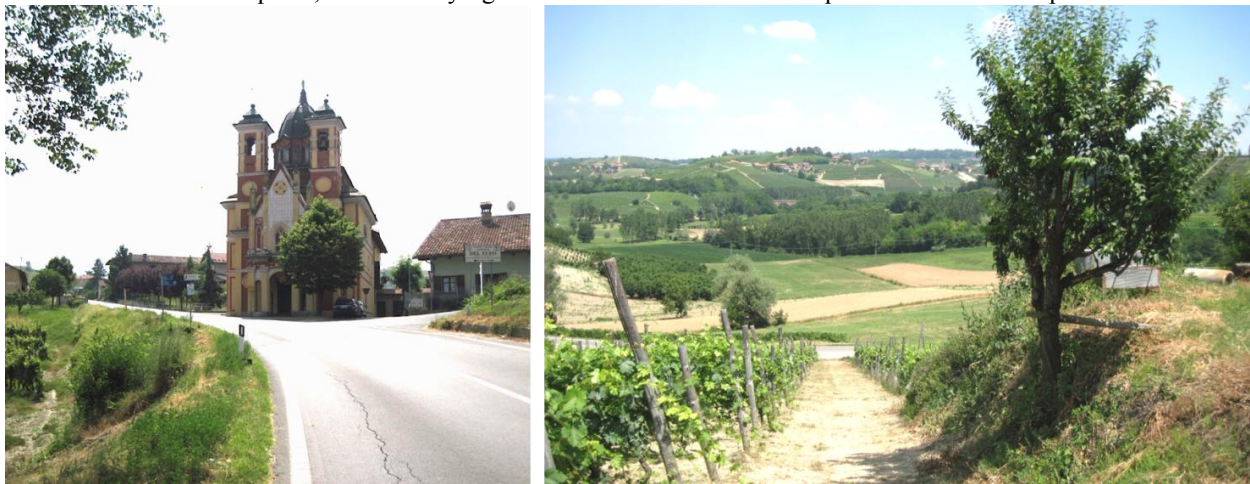
Figure 3. The shrine of Dogliani (Santa Maria delle Grazie) and the landscape.

By adopting policies and strategies in order to sustainably manage the tourism phenomenon [17] can lead to a controlled growth process and reduce negative impacts generated by uncontrolled tourist activity. Therefore, it is essential to elaborate use paths, thus identifying tourist routes and observation points on the landscape.