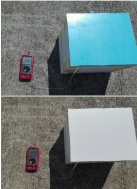
Fig.1 The experiment carried out at CERN Idea Square.

The prototype was positioned under the sunlight, firstly with the light blue roof. The initial temperature inside the prototype ( T_0 ) was measured and equal to the ambient temperature of 33°C. After a thermal transient of 20 minutes, the final temperature ( T_F ) has reached the value of 40°C.