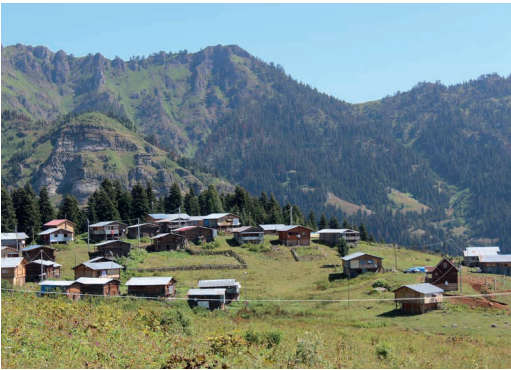
Fig. 2 – Köy (above) and yayla settlements (below).

al, the settlements are dispersed, dwellings are far apart and independent from each other. The houses are located mostly on the slopes, while flat lands are used for agriculture (Sümerkan, 1990).