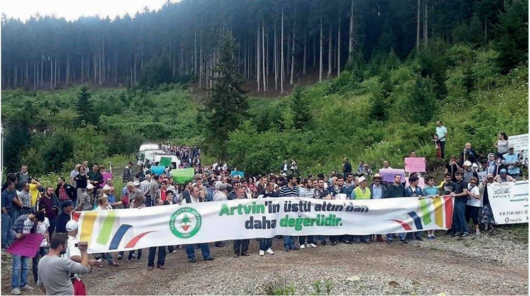
Fig. 10 – The locals are protesting against mine extraction in Cerattepe ( http://yesilartvindernegi.org/ ).