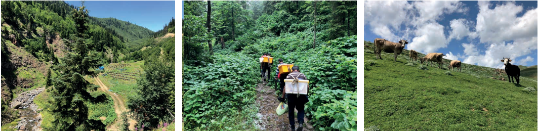
Fig. 3 – Multi-scale socio-economic relations in Imerhev Valley (author, 2018).

storage in the houses, while the long balconies are used to dry food. Each house has a guest room for hospitality of the villagers and the long distances between villages that prevent travelling within a day. In addition to the houses, there are auxiliary structures such as mereks , mills and bridges. Mereks are used to store grass, straw, clove and maize to be given to the animals during winter period. Mills are used to grind corn, wheat and barley to produce flour. Most of the mills in the villages were demolished or not used but still, in every village there are at least 1-2 mills in active use.