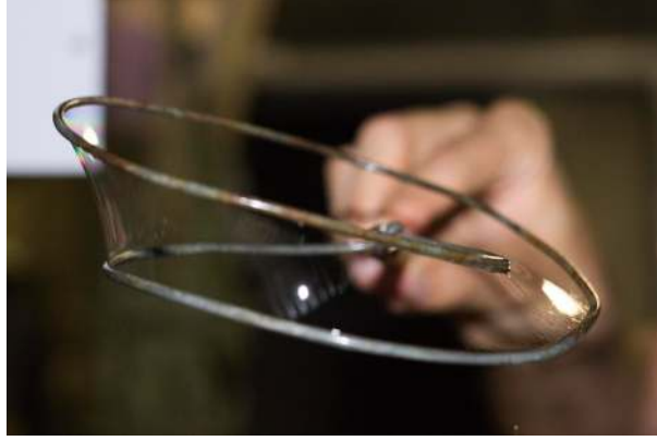
Figure 5: A Möbius strip-like soap film

the mass-minimizing integral current. When n > 7 we already know that the regularity is lost, since the result of Bombieri-De Giorgi-Giusti [4]. In any case, as for sets of finite perimeter, we cannot hope to have the singularities developed by some soap films. However, notice that such singularities appear when we have, as boundary, curved objects which are not well covered by the theory of currents: for instance, in the Figure 1 we can see a singular soap film, surely not covered by currents, but here the problem is that this soap film cannot be reduced to a rectifiable current whose boundary, in the sense of currents, is the set of the edges of a cube.