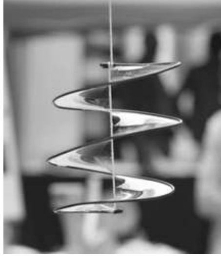
Figure 3: The elicoid as a soap film.

The difficulty with this equation, which is again \mathbf{H} = 0 , is hidden in the growth of A : indeed A has linear growth in the gradient, so that the natural Sobolev space where one could consider the minimization problem for A is W^{1,1}(\Omega) . But this space is not reflexive, hence the direct methods of the Calculus of Variations cannot be easily applied. In order to treat functionals as A one has to move to the space of functions of bounded variations , but in this case one has to consider also discontinuous solutions, which are not physical. To overcome the difficulty an idea could be to modify the area functional in such a way it becomes a functional with superlinear growth. This is the key point of the Douglas-Radó approach, which we are going to describe in the next Section.