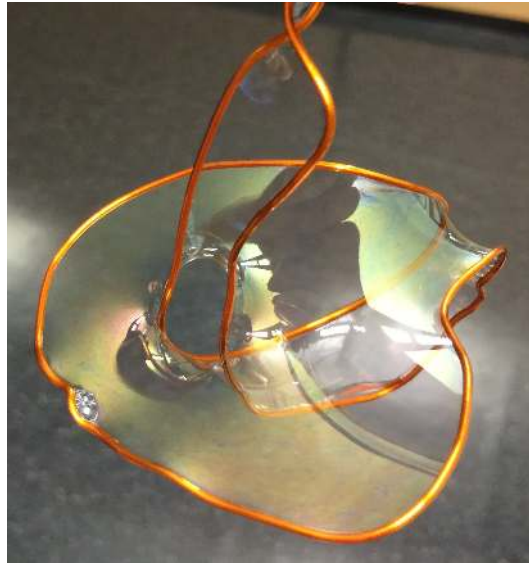
Figure 4: A soap film which bounds a Jordan wire but it is not of disc-type: the disc-type solution indeed should have a self-intersection.

We conclude the section relative to the disc-type Plateau problem with some remarks. First of all about uniqueness: for a given boundary curve \Gamma there may exist a lot of solutions of different genus, orientable and non-orientable and so on. Concerning regularity, it has been proven (see for instance Gulliver [10]) that disc-type minimal surfaces cannot have singularities in the interior, so they are smooth surfaces. This does not mean that disc-type solutions are embedded, and they also may have self-intersection, which is physically inconsistent. Hence, solutions of disc-type with self-intersection for sure are not a good model for soap films. All of these phenomena are related in