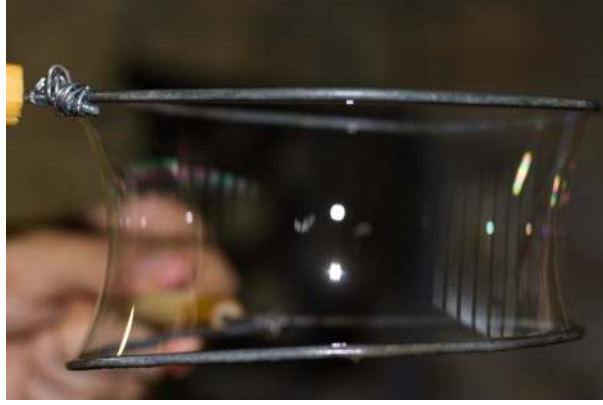
Figure 2: A catenoid as a soap film that spans two coaxial rings.

catenoid is a local minimizer. We conclude with another example of minimal surface which is the elicoid . Let