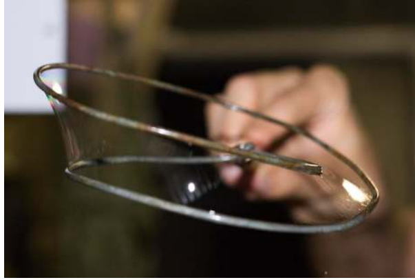
Figure 5: A Möbius strip-like soap film

the mass-minimizing integral current. When n > 7 we already know that the regularity is lost, since the result of Bombieri-De Giorgi-Giusti [4]. In any case, as for sets of finite perimeter, we cannot hope to have the singularities developed by some soap films. However, notice that such singularities appear when we have, as boundary, curved objects which are not well covered by the theory of currents: for instance, in the Figure 1 we can see a singular soap film, surely not covered by currents, but here the problem is that this soap film cannot be reduced to a rectifiable current whose boundary, in the sense of currents, is the set of the edges of a cube.