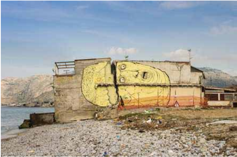
Fig. 04 : Carini, Palermo. "Welcome to Palermo – Vamos a la playa" project, 2017

It can be declared that the ineligibility for building development of the coastal belt corresponds to a fundamental principle in Italian legislation. Nevertheless, in the last decades there has been an indiscriminate use of the soil, and the need for massive re-qualification of the coasts is now under utmost priority. The latest top-down measures in Italy include two important legislative innovations which integrate all in all in a promising way the current national legislation on coastal protection. The awareness-raising project carried out with tenacity by Legambiente (fig.05) and other ecologist associations has contributed to the approval of Law 68/2015, which partly complies with the European Union Directive 2008/99 on "Environmental Protection". The new crimes against the environment included in the Italian Criminal Law are five: environmental pollution, environmental disaster, traffic and abandonment of high radioactivity, obstruction of control and omission of reclamation. If the singularity of illegal building activity cannot be considered a national pride, with the introduction of this law into its Criminal Code, Italy stands in a prominent position in the fight against eco-crimes. Thanks to this law, in 2017 sea-