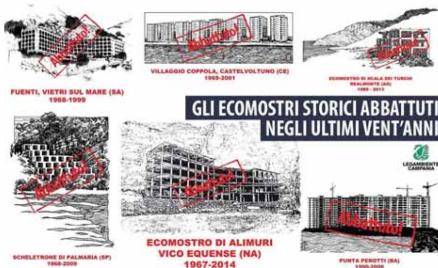
Fig. 05 : Legambiente's White List, 2014 ( www.legambiente.it )

related offenses were 15% less than the previous year 14 . The eco-crime law aims to prevent illicit, but on the other hand it also transforms many of the offenses covered by the 2006 Environmental Code into administrative sanctions: the extinction of the offense is once again foreseen only by the payment of a fine.