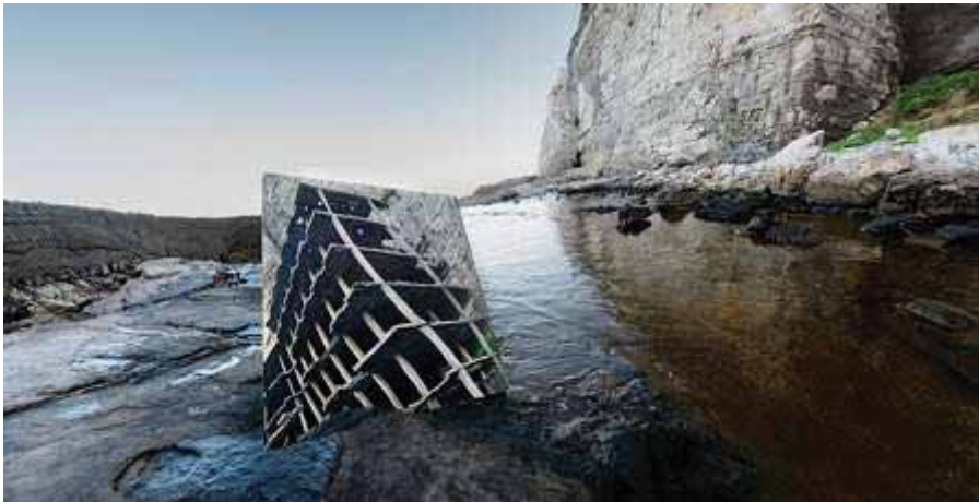
Fig. 01 : Alimuri, Vico Equense (Napoli).

In the '70s, Italy went through a heavy economic crisis, which caused a strong inflation. The Italian middle class, who held the greatest economic resources, decided to invest its savings in the construction of the second house, often illegally overbuilding the coasts. Unauthorized construction became for many people the only safe investment.