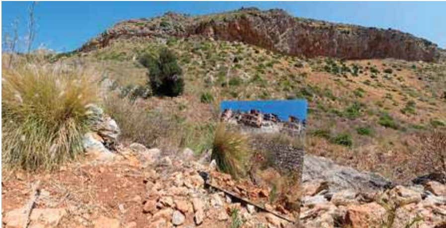
Fig. 02 : Pizzo Sella, Palermo. Ph. Maria Teresa Furnari, "Ecomostro Tour", 2014 ( www.mariateresafurnari.com )

There are very few actual destruction orders, even when confirmed by final judgments of the judiciary. Demolition orders actually executed, even when provided for by the final judgments of the judiciary, amount to about 10-12% of those issued 5 . Although in Italy the judicial authority is independent from the other powers, in order to complete the demolition, financial resources are necessary, which can only be demanded by the mayor in whose territory where the demolition needs to be implemented. If the mayor does not activate, the demolition process cannot proceed.