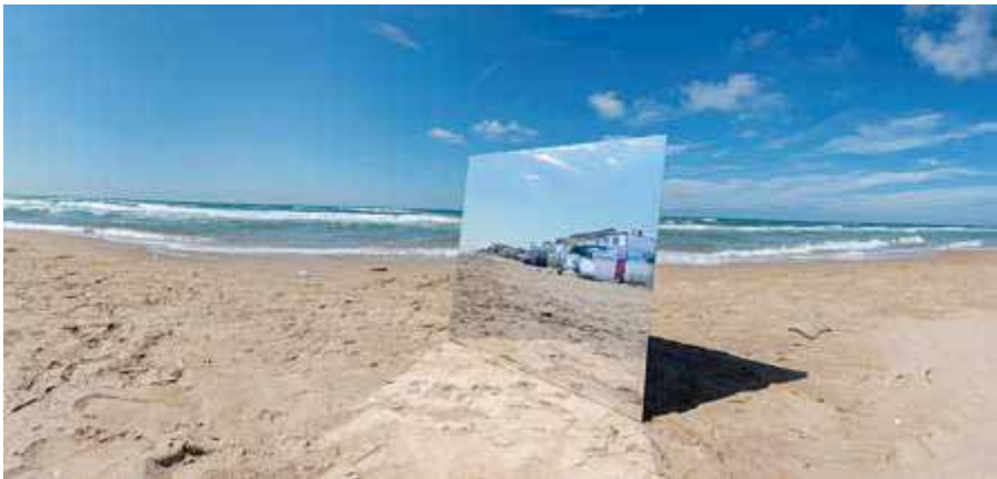
Fig. 03 : Torre Mileto, Lesina (Foggia).

Thanks to the media pressure of associations and journalists on the theme of environmental protection, some significant neologisms have begun to become part of the current language, as eco-crime, eco-mafia or eco-monster. Within environmental protection policies, environmental crime has been defined as a crime that has produced environmental and ecological deterioration. The main environmental perpetrators are linked to organized crime, mostly mafia, environmental crime that is called eco-mafia.