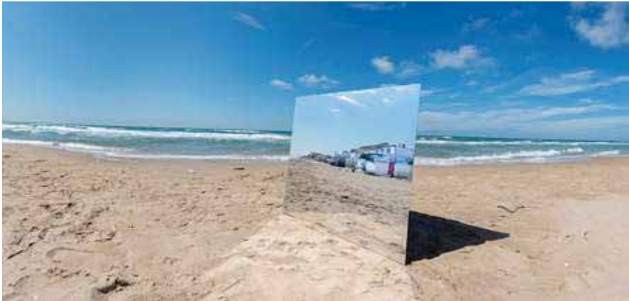
Fig. 03 : Torre Mileto, Lesina (Foggia).

Thanks to the media pressure of associations and journalists on the theme of environmental protection, some significant neologisms have begun to become part of the current language, as eco-crime, eco-mafia or eco-monster. Within environmental protection policies, environmental crime has been defined as a crime that has produced environmental and ecological deterioration. The main environmental perpetrators are linked to organized crime, mostly mafia, environmental crime that is called eco-mafia.