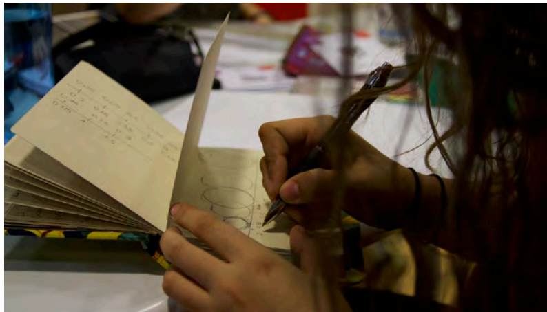
Figure 3. First formal explorations starting from the created dataset.

10. Playing with shapes, colours and sizes. Participants are asked to free their creative and original inspiration by looking for the right shapes and the most coherent colours to highlight the internal relationships between the elements. Also, yet to create multiple levels of reading, from general to detail, determining the most appropriate hierarchy in content; continue experimenting by adding all the tangential elements useful for contextualisation as well as supporting numbers and therefore the label, reaching the almost final creation of the actual visualisation. (Figure 4).