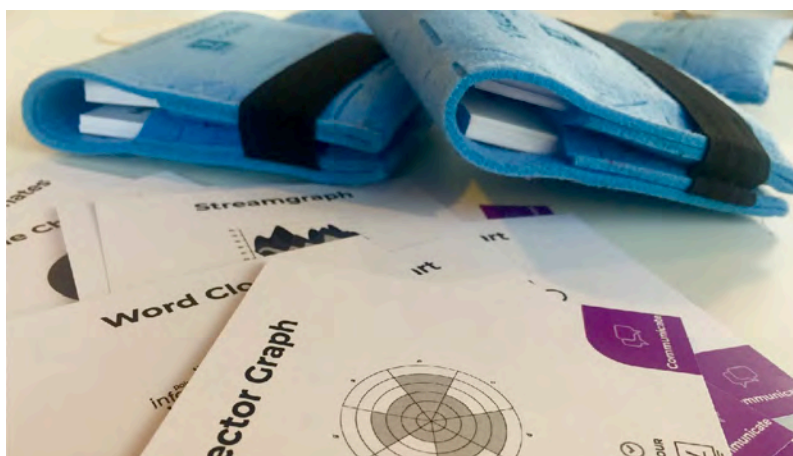
Figure 1. The Visualisation Method Toolkit