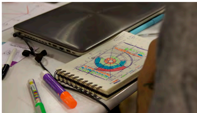
Figure 4. Students start playing with shapes, colours, spaces and dimensions.

10. Playing with shapes, colours and sizes. Participants are asked to free their creative and original inspiration by looking for the right shapes and the most coherent colours to highlight the internal relationships between the elements. Also, yet to create multiple levels of reading, from general to detail, determining the most appropriate hierarchy in content; continue experimenting by adding all the tangential elements useful for contextualisation as well as supporting numbers and therefore the label, reaching the almost final creation of the actual visualisation. (Figure 4).