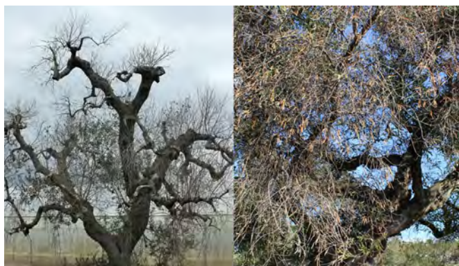
Figure 1. The olive groves of Gallipoli (Apulia, Italy) after the spread of Olive Quick Decline Syndrome (by authors).