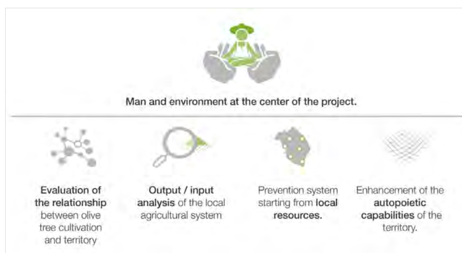
Figure 5. Systemic design principles adopted for the protection of the olive trees of Salento, Apulia, Italy (by authors).

The five principles of systemic design (Bistagnino, 2011) represent the cornerstone of this transdisciplinary design process, but first of all, they were indispensable tools for the pursuit of a wide phase of research and analysis. The methodology adopted within the project phase has addressed these five elements in a very specific order (Figure 5).