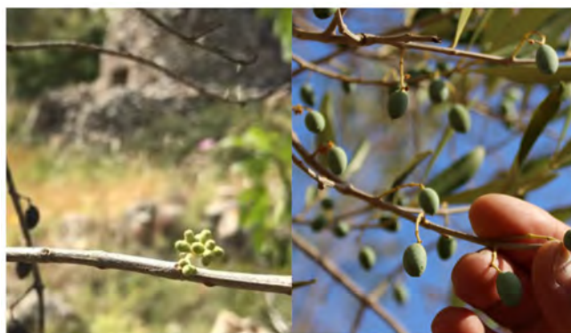
Figure 4. Sign of recovery after treatment tested through collaboration with specialized figures in the agro-technical field (by authors).

They demonstrate how this approach, going through different disciplines and escaping from any sectoral categorization at the same time, can lead to results of superior validity. In fact, they demonstrate not only the solution to the problem itself, but also that of the complications that revolve around it. However, this general outcome is only possible through a capillary understanding of the question taken in analysis and of all its implications. Through a transdisciplinary approach, the flexible planning capacity of systemic design not only leads to a functional and sustainable project, but also to a coordination of the efforts made by all the figures involved, mediating different