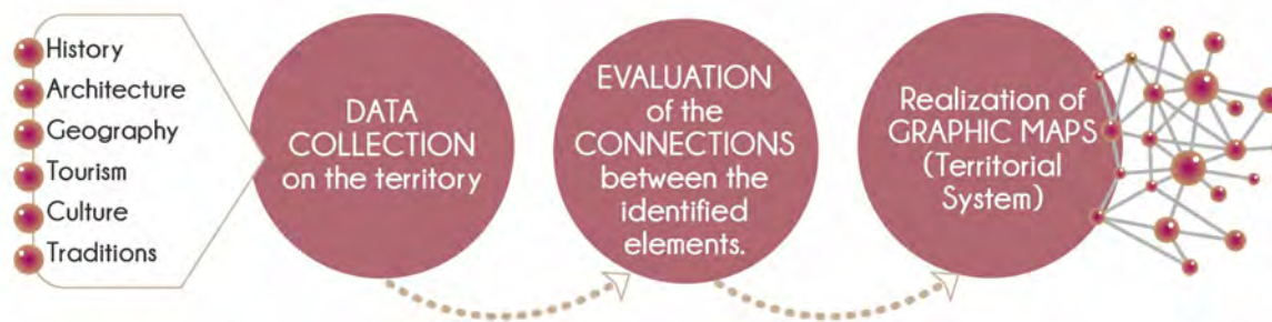
Figure 2. Methodology adopted in the systemic analysis of the Apulian territory (by authors).

Conscious of the identified interconnections, a graphic visualization of the present relations among the territorial elements was realized. These graphic maps have made tangible the numerous links between all the social, environmental, economic and cultural components of Apulian territorial system.