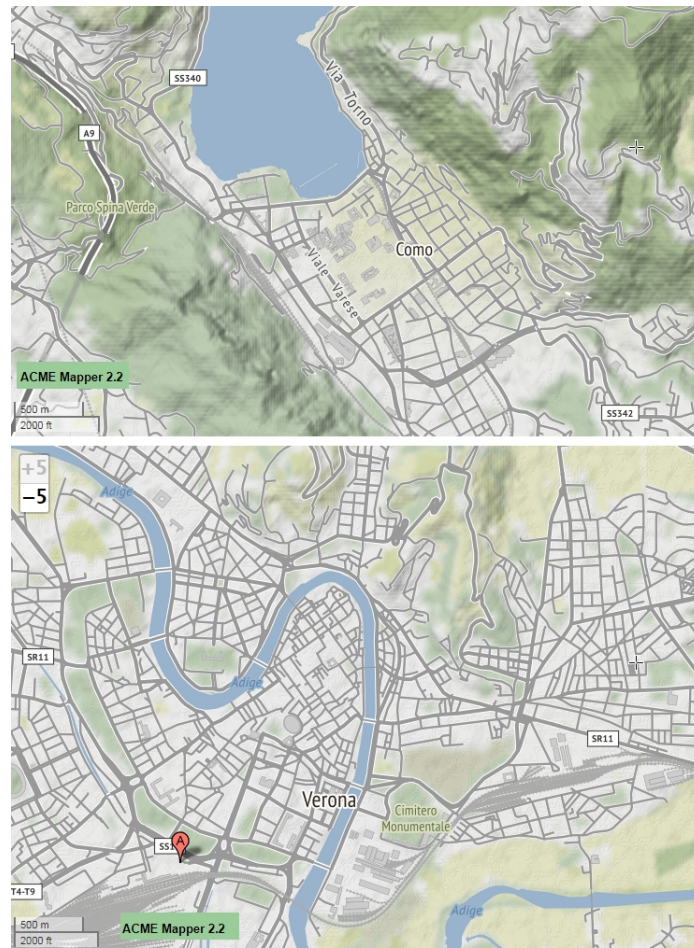
Figure 1: Thanks to Acme Mapper, https://mapper.acme.com , we can appreciate very well the terrain of Como (upper panel) and Verona (lower panel). The core of the Roman Verona is in the bend of the Adige river.