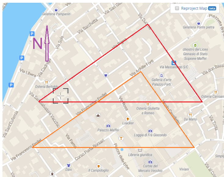
Figure 4: The same rectangular triangle 3,4 and 5 in Verona shown on a epsg.io map.