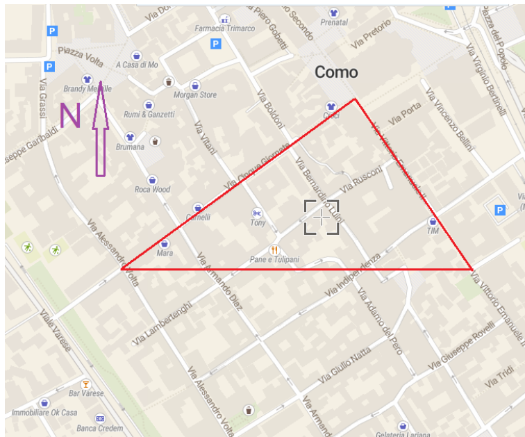
Figure 3: Como and its rectangular triangle 3,4 and 5 shown on a epsg.io map (© MapTiler © OpenStreetMap contributors).

As we can see from the Figure 1, the terrain of the two towns is quite different. But, as shown by the Figure 2, the layout is the same. So let us consider if we can find a possible geometry of this layout. We assume that the insulae of the centuriation were squares and that the squares had, more or less, the same size. Let us note that, during the centuries, the insulae had been deformed and therefore it is difficult to see today the original Roman layout perfectly maintained in the town.