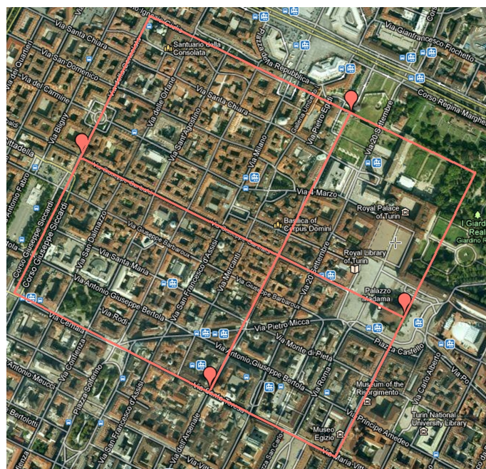
Figure 3: This is the Roman Torino from Acme Mapper. The places of the four gates are marked (two of them are still existing). The Decumanus Maximus, the modern Via Garibaldi, is the inclined east-west line. Note the blocks coincident with the roman insulae. The “umbilicus”, the centre of the town, is at the crossing of the decumanus and the cardo. The perimeter of the Roman town is running from Porta Palatina to Via della Consolata. Then the perimeter turns south on Via della Consolata and Corso Siccardi. On this side, there was the gate Porta Segusina, of which nothing remains. At the corner of Via Cernaia, the perimeter turns toward Porta Marmorea, completely dismantles. Today, on this path there are Via Cernaia, Santa Teresa, Maria Vittoria, Piazza San Carlo. At the corner of the Academy of Sciences, where we find the Egyptian Museum, the perimeter is running due north, crossing Piazza Castello, where there is the Porta Decumana. Then the perimeter crosses the area of the Royal Palace, returning to the Porte Palatine.