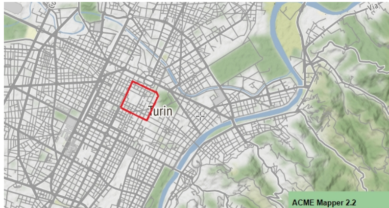
Figure 2: Thanks to Acme Mapper, https://mapper.acme.com , we can appreciate the position of Augusta Taurinorum, the red square, and the terrain surrounding it.