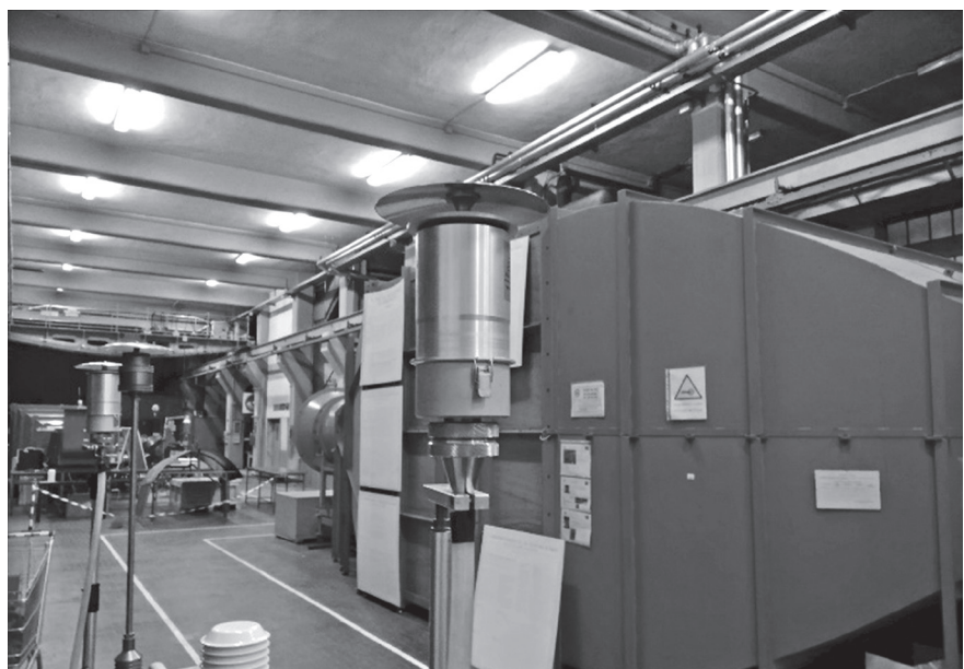
Fig. 1. Measurement chains. On the background the wind tunnel. did a italiano