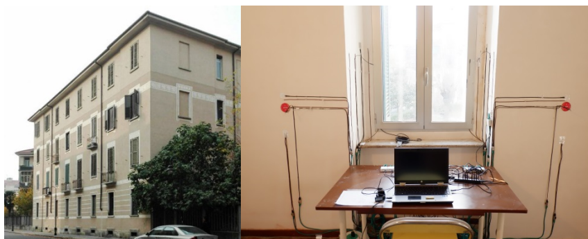
Figure 1. The Italian case study (ATC building).

The monitoring phase on the developed products started in November 2018 and will continue until the end of the project (September 2019).