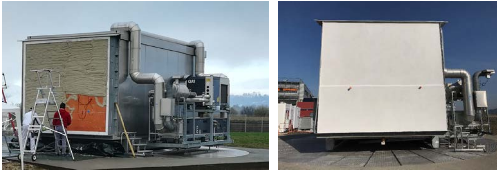
Figure 4. PASSYS test cell installation (all project products)