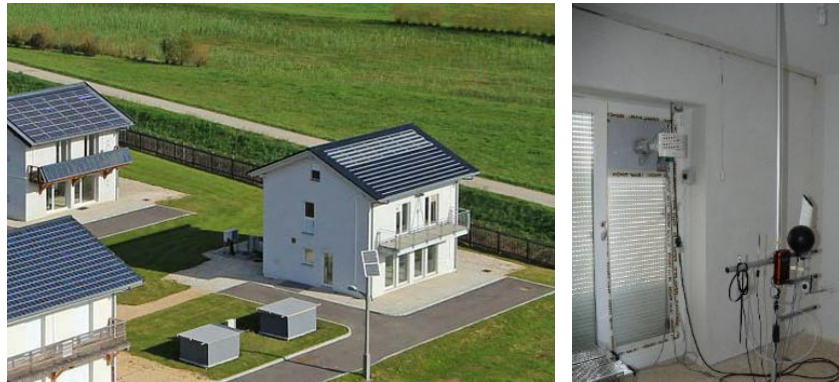
Figure 5. The French case study (INCAS test houses)

As a demo activity, thermal coating finish was installed in a test room in one of the 4 test houses of INCAS's platform (Figure 5). This house is a recently built high energy performing one, where the test room is compared with a reference room from an environmental quality point of view: thermal comfort and indoor air quality are recorded.