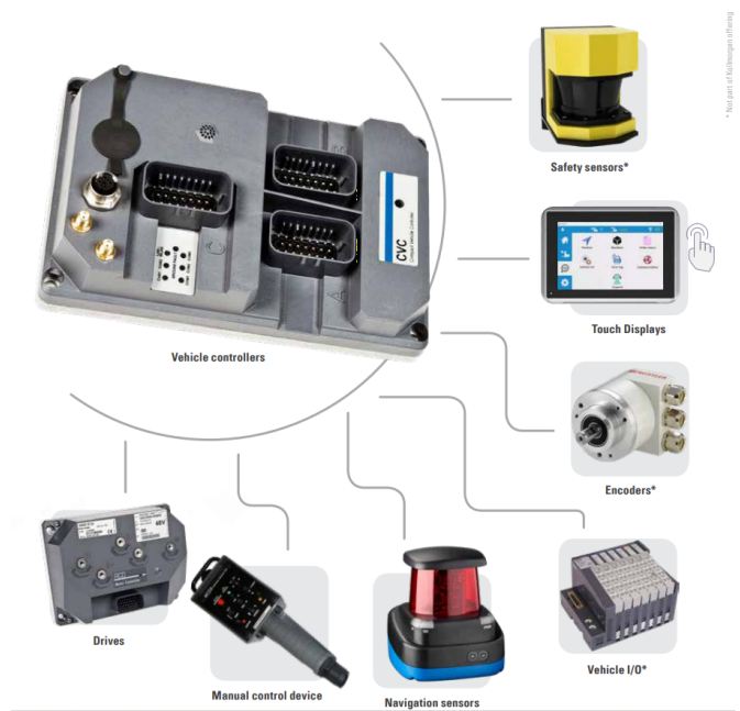
Fig. 1. Hardware ecosystem for AGV from Kollmorgen [14]

If you want to create your own AGV with the COTS components of a pure supplier, it is however necessary to consider also the safety aspects, besides the mechanical issues. These safety aspects involve practically all the AGV components, from motor encoders to safety laser scanner management.