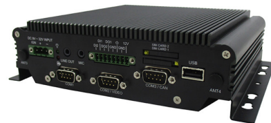
Fig. 2. Hardware for AGV from Navitech Systems [15]

For safety management, specialized companies like SICK [18] or PILZ [19] produce ad hoc certified boards with the appropriate safety levels.