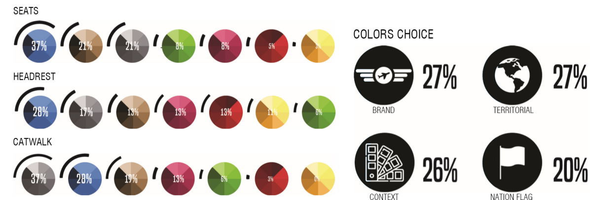
Figure 2: Colour trends detected in the cabins of the main airlines.