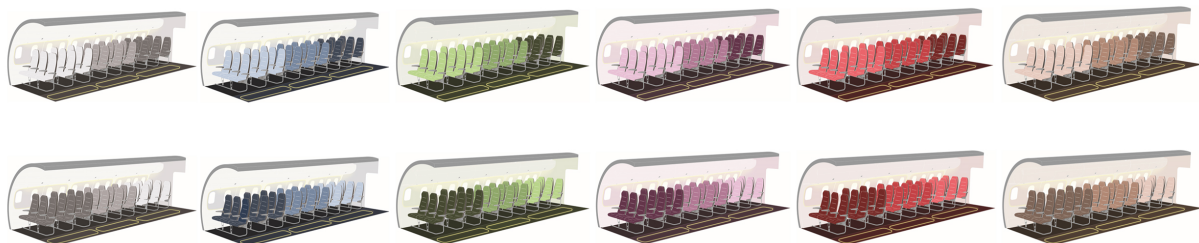
Figure 4: The six hypotheses of association between patterns (3 rows of seats) and colors of seats and cabin surfaces.

3. Perception of comfort and feelings: in this session on sensations, the subject was asked to express an opinion on how space and environment were perceived in terms of stress, comfort, harmony, elegance, and safety, assigning, a value from zero to five for each of these factors.