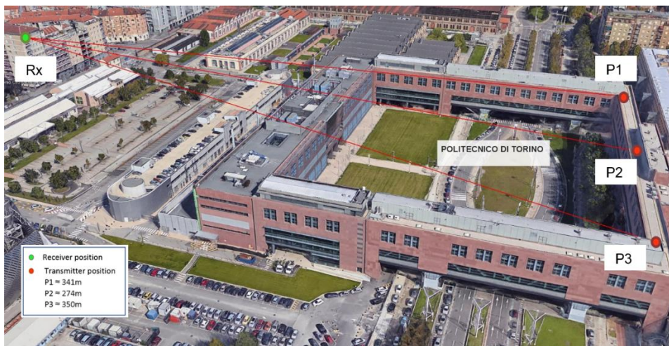
Figure 1. Setup 1. Position of the transmitters (P1, P2, P3) and of the receiver (Rx) with relative distance.

The receiver positions P1 and P3 were in line of sight with the transmitter while the position P2 was behind an obstacle. This fact allowed also to check the signal quality when the transmitter is not completely in line of sight with the receiver. This is a common situation for an urban environment where potential transmitters can be partially, or totally shielded by houses. It is important to mention also that, below the receiver position P3 and along the south side of the roof, there was a metal structure that could also introduce