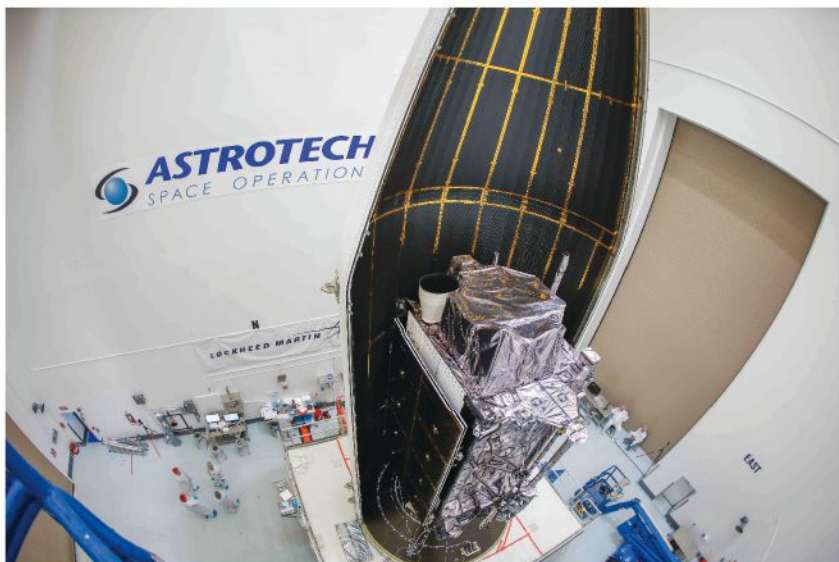
THE SECOND GPS III satellite is encapsulated in preparation for launch on August 23.

Additional GPS IIIIF capabilities will start being added with the 11th GPS III satellite. These will include a fully digital navigation payload, a Regional Military Protection (RMP) capability, an accuracy-enhancing laser retroreflector array, and a search-and-rescue payload. 🌐