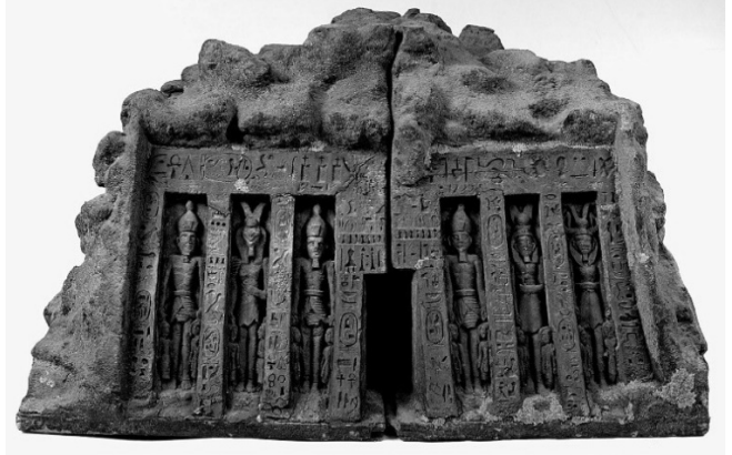
Fig. 1 Wooden model attributed to Jean-Jacques Rifaud, conserved in the Egyptian museum of Turin.

The project will involve the application of the proposed methodology to some small objects belonging to the collection of the Museo Egizio in Turin. The achieved digital models will be used to demonstrate the way in which museums can utilise them for different purposes: to monitor their collections (3D repository linked to a database) and offer the users (visitors) the possibility of exploring objects stored in their depots and storerooms that cannot be put on display due to a lack of space.