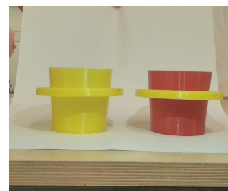
Fig. 1. The first 3D-printed prototype, which allowed us to understand we were after the wrong form

Ultimately, we identified five possible solutions of the idea we selected and we voted on them. We reached consensus on one (floating platforms), that was to be followed-up on with more research on its technical and economical feasibility. However, we realized that solution was not feasible (see Results section). In the meantime, partially repeating the steps of research and ideations phases, we arrived to a second solution, which we immediately started to prototype (see Results section). In this phase we applied the rapid changes and high adaptability that nonlinear innovation requires.