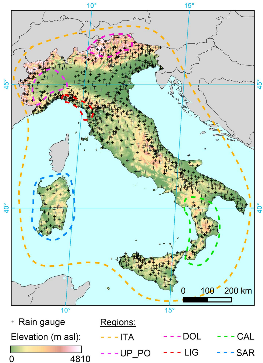
Figure 1. Rain gauges and regions considered in the analysis.

et al., 2014), but, to our knowledge, it has not yet been considered with reference to rainfall extremes of short durations. The RB analysis considers each single station separately, and this feature needs to be overcome to investigate changes at a regional scale.