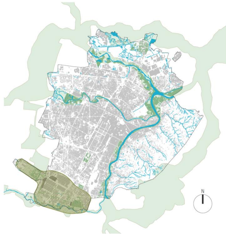
Figure 2. City of Turin Map, on the dark area is located the Mirafiori Sud District. (Author: City of Turin, 2018)