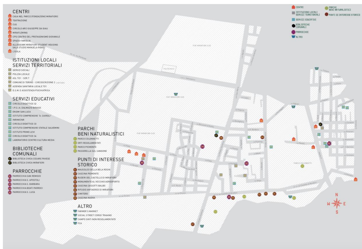
Figure 2. Mirafiori Sud District services map, first approach on Holistic Diagnosis. (Author: Fondazione Mirafiori, 2018)