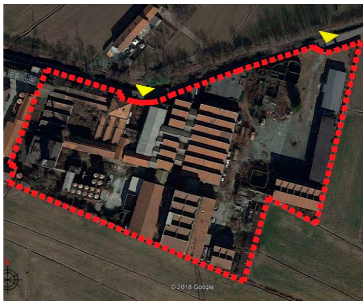
Figure 2. The area [22].