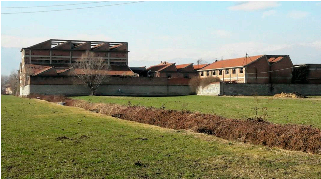
Figure 4. The area from outside [22].

Assuming that the area can be used for energy production, to supply part of the public administration’s needs, some further clarifications are required. First, it is assumed the town