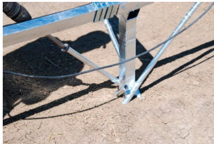
Figure 6. The module anchoring system to the ground [25].

The financial assessment of the investment was evaluated according to the scheme shown in Figure 7.