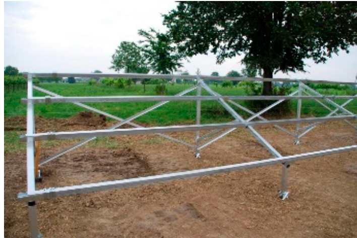
Figure 5. The selected photovoltaic panels' support module [25].

administration provides demolition of the dilapidated buildings, thus achieving a clearance of part of ground. Second, we can create a photovoltaic field within the town using the free areas of the site and building roofing that were put in safe to partially compensate for the electricity needs of public users (schools, malls, etc.) without land consumption [23,24]. All this, without any interference with the polluted ground, is possible through the use of a very light system to secure the photovoltaic supporting frame to the ground without excavation (Figures 5 and 6).