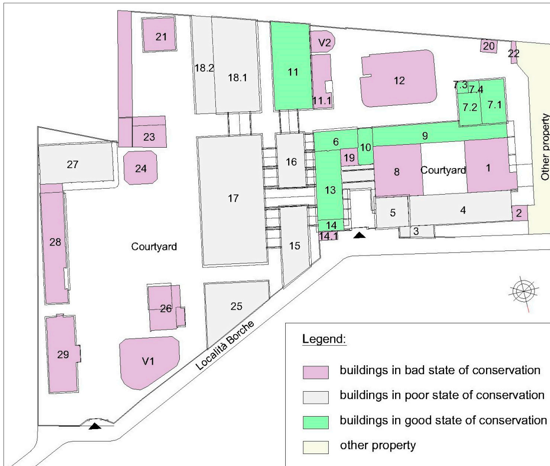
Figure 3. The case study representation of buildings and their state of conservation (plan by the authors on the basis of cartographic data provided by the municipality).