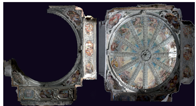
Figure 1.- Orthophotograph made from the three-dimensional model of the dome of the Purification Chapel of the church of Santa Maria del Carmine in Milan, Italy.

We have a case where the three-dimensional restitution is made in draft form using the technique of convergent photogrammetry (restitution of geometry by performing conventional photographs that are interpreted by a computer programme which also generates a three-dimensional model texture—mapping—applied to it) García León (2008). The preference for using this technique rather than others, such as a laser scanner, is because we are obtaining a map of faithful colours applied to a three-dimensional model which is essential for our purposes and the cameras of the scanner do not allow us to obtain a final quality result. Conventional digital photography applied in this system allows us to perform white balance, and all necessary corrections before making photographs, thus giving us a high quality texture.