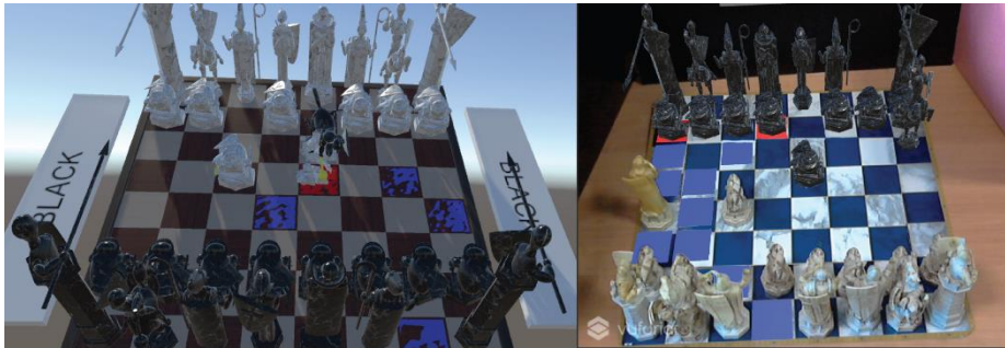
Figure 1: in both environments, when the player has to move the piece, the available moves are shown on the game field.

using the air tap gesture and the available moves are shown on the real chess board. If one or more of the available moves intersect an enemy piece, that specific tile is highlighted in red. Then, the VR interface receives the data regarding the piece that is going to be moved. Afterwards, the AR user, moving the 3D cursor on an available tile, can select it performing another time the air tap gesture. Finally, the VR interface receives the data regarding the final position and the virtual piece is moved in the VR application.