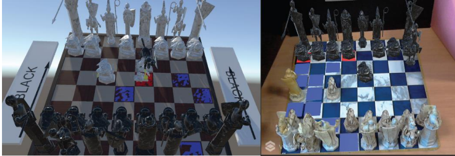
Figure 1: in both environments, when the player has to move the piece, the available moves are shown on the game field.

using the air tap gesture and the available moves are shown on the real chess board. If one or more of the available moves intersect an enemy piece, that specific tile is highlighted in red. Then, the VR interface receives the data regarding the piece that is going to be moved. Afterwards, the AR user, moving the 3D cursor on an available tile, can select it performing another time the air tap gesture. Finally, the VR interface receives the data regarding the final position and the virtual piece is moved in the VR application.