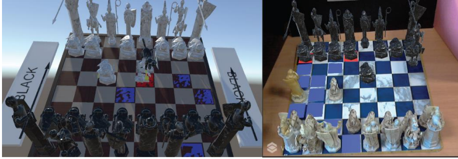
Figure 1: in both environments, when the player has to move the piece, the available moves are shown on the game field.

using the air tap gesture and the available moves are shown on the real chess board. If one or more of the available moves intersect an enemy piece, that specific tile is highlighted in red. Then, the VR interface receives the data regarding the piece that is going to be moved. Afterwards, the AR user, moving the 3D cursor on an available tile, can select it performing another time the air tap gesture. Finally, the VR interface receives the data regarding the final position and the virtual piece is moved in the VR application.