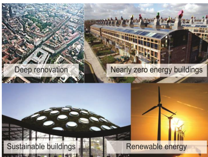
Figure 4. Challenges in the construction industry

The challenges in EU construction industry go through concepts like deep renovation, nearly zero-energy buildings, sustainable buildings, renewable energy, fig. 4. These concepts reflect in many research programs financed by the European Commission.