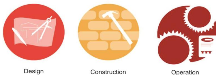
Figure 3. Holistic approach

A high efficiency process is realised when all the stages of the process are approached in a holistic way, not only during the concept and the design phases, but also during construction and operation, fig. 3.