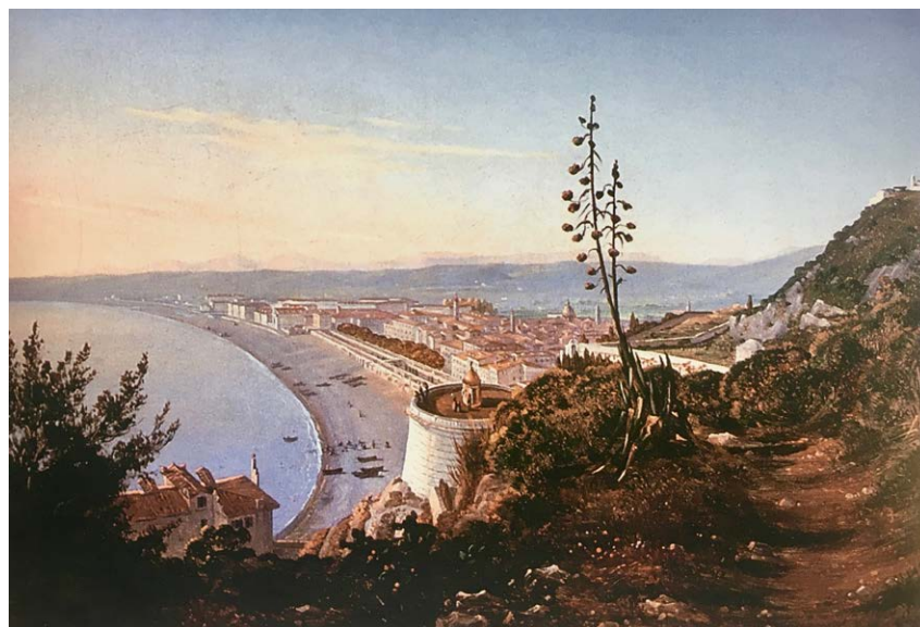
Fig. 11 – François Bensa, Vue de la colline du Château , 1880. Nice, Musée d'Art et d'Histoire du Palais Massena.

acknowledged as a singularity much before its official renaming as Côte d'Azur by Stéphen Liégeard (1887, 30). According to many authors' words, the park on the hill – still under construction – became the first source of health and wellness for any visitor, who could finally breathe salubrious air while also enjoying a soothing vista . Gradually, and thanks to the many re-writings of a repetitive literary palimpsest, the landscape of Nizza was becoming “a cultural practice”, or