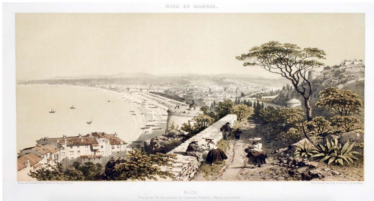
Fig. 10 – Vue prise de la hauteur de l'ancien château , 1864. Nice, Archives Départementales des Alpes-Maritimes, 02NUM.03549/03.