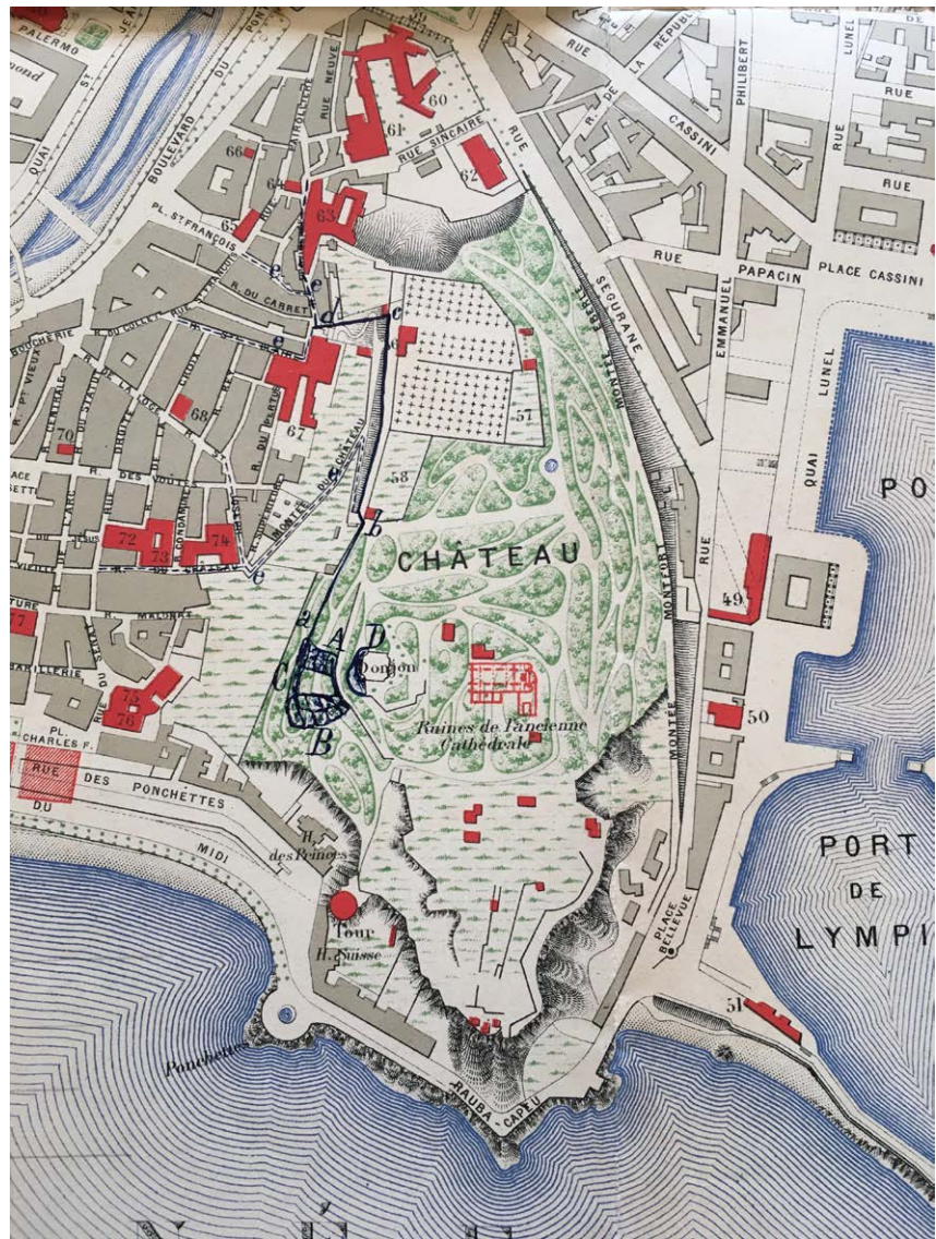
Fig. 13 – Plan général indiquant les deversoirs de la Cascade et les conduites amenant l'eau en tête des Egouts de la vieille-Ville , manuscript notes on François Aune. Plan de la ville de Nice avec le tracé des alignements projetés , detail. Nice: B. Visconti, 1882. Nice, Archives Municipales, 1.O.6/7.