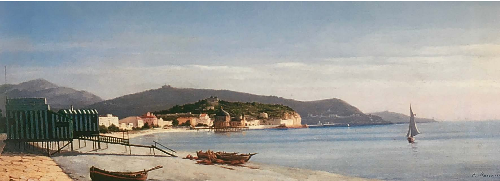
Fig. 12 – César Mascarely, La Baie des Anges vers la colline du Château , 1880 ca. Nice, Musée Masséna. Private collection.