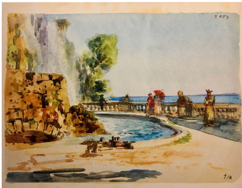
Fig. 15 – Alexis Mossa. Le bassin au Château , 1898. Nice, Musée d’Art et d’Histoire du Palais Massena.

Quite unexpectedly, when Nizza Marittima became the French city of Nice in 1860, the tourist had already replaced the soldier, victoriously. The countess of Drohojowska, the first foreign visitor recording the annexion of the County of Nice to the French Empire, could enjoy few more details in the new garden, albeit emphasising the amazing view of the city and the sea (Drohojowska 1860, 24-25). Three months later, a sumptuous visit of the Emperor Napoleon III and his wife Eugenia de Montijo, during the “memorable days of September 12 th -13 th ”, finally celebrated the power shift in Nice (Saint-Germain 1860, [3]). The schedule was pretty intense but, not surprisingly, the “ancient castle” was the first destination of the imperial cou-