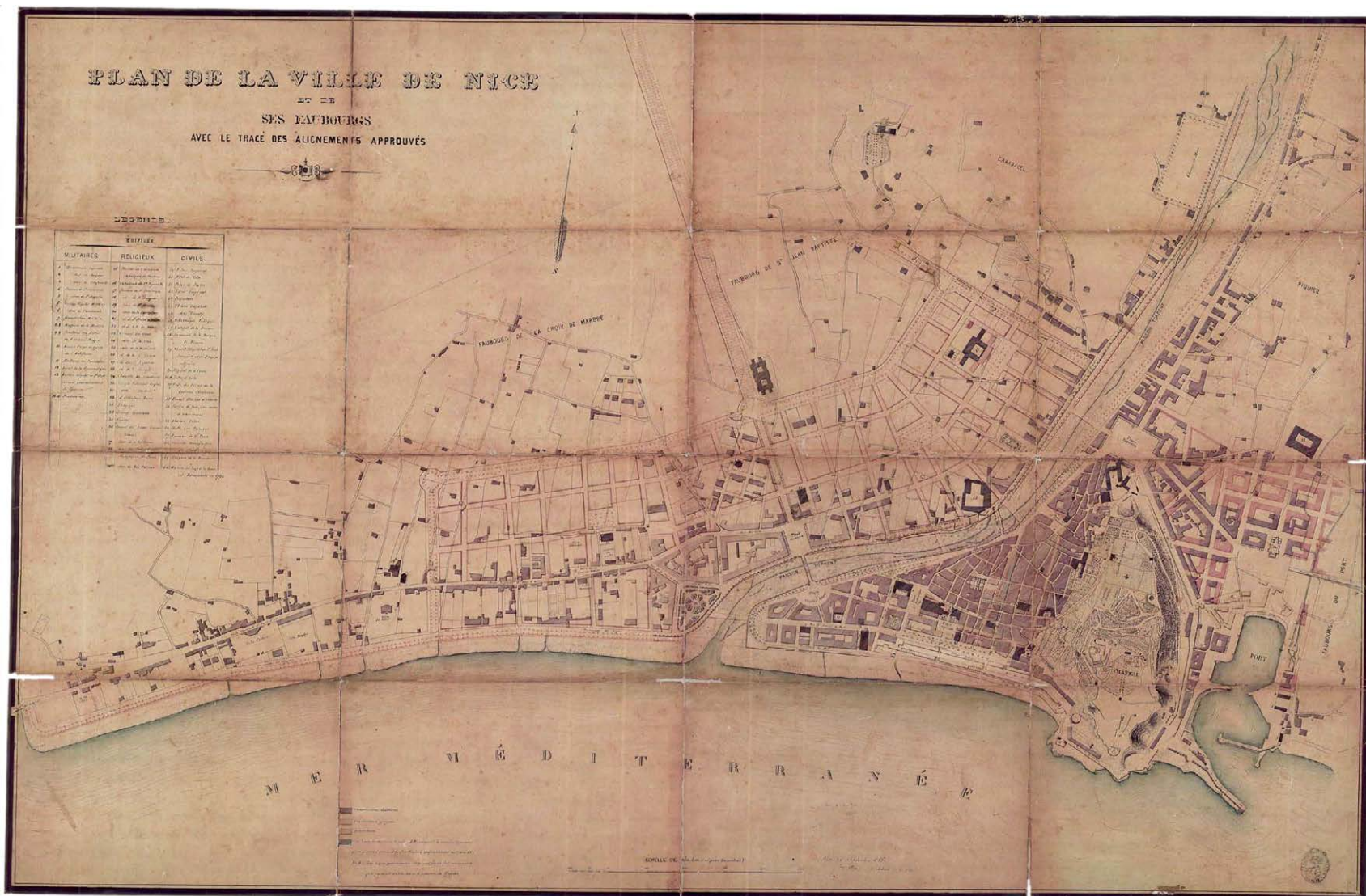
Fig. 9 – Plan de la ville de Nice et de ses faubourgs avec le tracé des alignements approuvés , 1860. Nice, Archives Municipales, 1.Fi.1/18.

30 “J’ai un appartement délicieux dont les fenêtres donnent sur la mer. Je suis tout accoutumé au continuel râlement des vagues; le matin, quand j’ouvre ma fenêtre, c’est superbe de voir les crêtes accourir comme la crinière ondoyante d’une troupe de chevaux blancs. Je m’endors au bruit de l’artillerie des ondes, battant en brèche le rocher sur lequel est bâtie ma maison” (author’s translation).