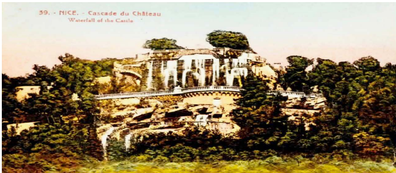
Fig. 16 – Cascade du chateau , 1900 ca. Nice, Archives Départementales des Alpes-Maritimes, 02Fi.01262.

39 “Rien de magique comme le spectacle qui se déroulait de là sous nos pieds” (author’s translation).