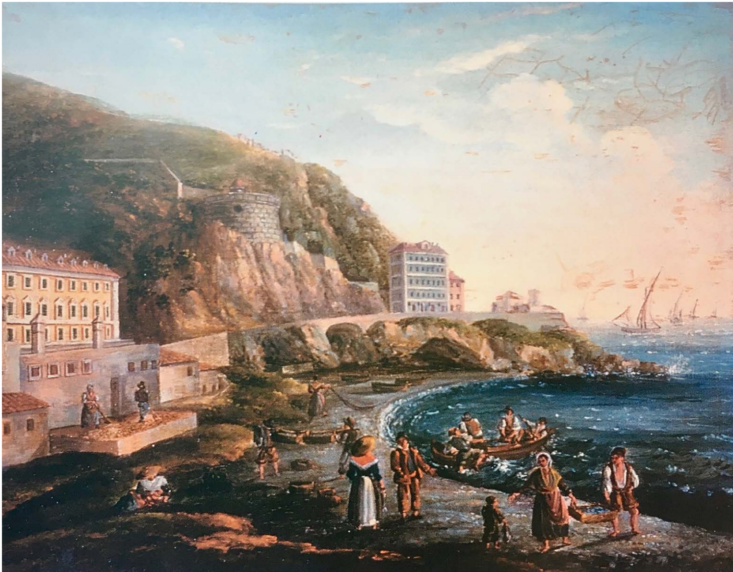
Fig. 2 – Clément Roassal, Vue des Ponchettes , 1820 ca. Private collection.

2 “Toute recherche pour donner une idée de l’ancienne Ville sur le château serait superflue. Les fortifications qui l’ont remplacée, et les bouleversements que les mines y ont opérés ont changé la face des lieux et fait oublier les anciennes dénominations.”