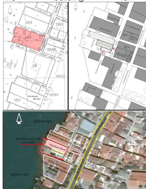
Figure 4) which is located on 14. Street, Sakarya District in Ayvalık/Balkesir-Turkey, covers an area of 1125 m 2 , of 582 m 2 which is occupied by the factory. The factory is located at the north-east part of the lot. It is composed of three blocks (See Figure 5) adjacent to each other. The main entrance to the factory is provided from 14. Street, from the middle block named as '2nd Block'. The courtyard entrance is also provided from 14. Street, through a courtyard door that is adjacent to the factory.