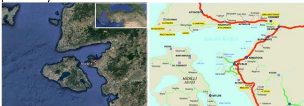
Figure 1: Location of Ayvalık (Google Earth, last accessed on September 12, 2016) and its close environment (source: http://www.thefullwiki.org/Ayvalik#Notes , last accessed on August 24, 2016)

This unique geography is covered with olive groves that are a component of the natural character of Ayvalık constituting almost 41.3 per cent of the region which is the main source of the industrial landscape of Ayvalık. There are more than two millions olive trees which originate from the wild olive ( olea olester ) that existed as local species among other species and were domesticated and converted genetically endemic species (UNESCO, 2017, para. 4).