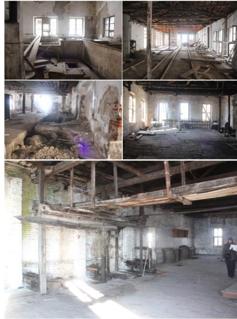
Figure 6: Ertem Olive Oil Factory

'3rd Block' of the factory named as 'Annex Block', has rectangular plan type which is two-storied block. It is 5.5x14.9 m in plan dimensions and 6.15 high from the ground level. '3rd Block' is the part of the factory that added lately as a storage for productions and resting places for the workers. It is a reinforced concrete structure that was articulated to the '2nd Block'. The entrance is provided to this block from the ground floor of it. Access to the first floor of this block is provided through a concrete stairs located in the courtyard adjacent to '2nd Block'. (See figure 6).