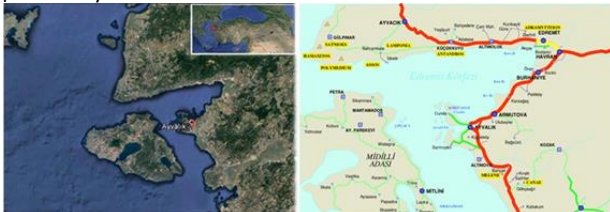
Figure 1: Location of Ayvalık (Google Earth, last accessed on September 12, 2016) and its close environment (source: http://www.thefullwiki.org/Ayvalik#Notes , last accessed on August 24, 2016)

This unique geography is covered with olive groves that are a component of the natural character of Ayvalık constituting almost 41.3 per cent of the region which is the main source of the industrial landscape of Ayvalık. There are more than two millions olive trees which originate from the wild olive ( olea olester ) that existed as local species among other species and were domesticated and converted genetically endemic species (UNESCO, 2017, para. 4).