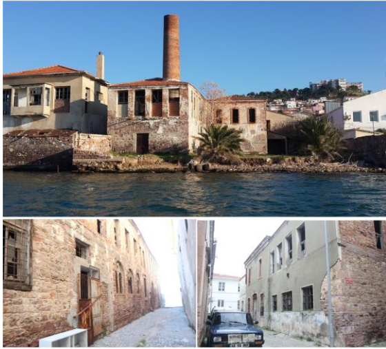
Figure 3: Ertem Olive Oil Factory, top: view from the sea; bottom left: the most elaborated façade; bottom right: entrance façade

Ertem Olive Oil Factory (See Figure 3) is one of the industrial heritage buildings in Ayvalık dating back to 1910 constructed before the population exchange -1923- by a Rum named Anastasyos Yorgolos (Efe et al., 2013: 65). The factory was used by several owners for producing olive oil and by-products. In 1952, the ownership of the factory took over to Ertem Brothers who give the name to the factory itself. Ertems who immigrated from Crete in 1924, was settled in Ayvalık after the population exchange. They were one of the important families that come from olive trade originated family and they operated the factory until 2000 (Efe et al., 2013: 65). Today, the ownership of the factory belongs to a Turkish Doctor who lives in the USA. It is abandoned and under the risk of destruction due to the factors of human and nature since 2000.