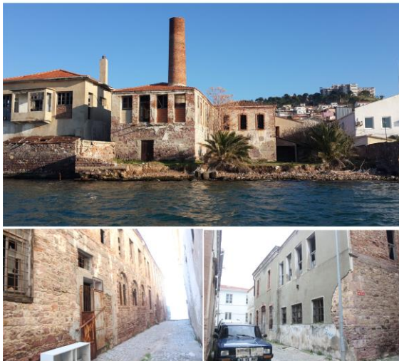
Figure 3: Ertem Olive Oil Factory, top: view from the sea; bottom left: the most elaborated façade; bottom right: entrance façade

Ertem Olive Oil Factory (See Figure 3) is one of the industrial heritage buildings in Ayvalık dating back to 1910 constructed before the population exchange -1923- by a Rum named Anastasyos Yorgolos (Efe et al., 2013: 65). The factory was used by several owners for producing olive oil and by-products. In 1952, the ownership of the factory took over to Ertem Brothers who give the name to the factory itself. Ertems who immigrated from Crete in 1924, was settled in Ayvalık after the population exchange. They were one of the important families that come from olive trade originated family and they operated the factory until 2000 (Efe et al., 2013: 65). Today, the ownership of the factory belongs to a Turkish Doctor who lives in the USA. It is abandoned and under the risk of destruction due to the factors of human and nature since 2000.