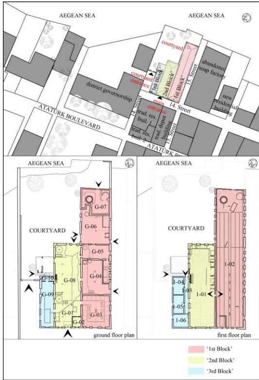
Figure 5: Blocks forming the factory, source: Gözde Yıldız, 2016.

People leave their cities to have a healthier life, '1st Block' of the factory named as 'soap production block' (Sabunhane Block), has rectangular plan type located on the northern edge of the lot. It is two-storied block that is measured 8x23.5 m in plan dimensions and 7.5 m high from the ground level. It is constructed with the stone masonry system at the ground floor and brick masonry system at the first floor. The ground floor of this block was arranged with five different spaces for the preparation of the soap production and partially olive oil production. The first floor of this block was arranged as a single large space for the soap production processing unit. The chimney is located at this block which is made out of brick. The entrance is provided from three sides of the block. '2nd Block' of the factory named as 'olive-oil production block' (Yağhane Block), has rectangular plan type located in the middle of the other blocks. It is also two-storied block that is measure 8x15.9 m in plan dimensions and 7.45 m high from the ground level. It was arranged as a single large space on both floors. While ground floor of this block serves as olive oil processing unit, the first floor of it serves for the preparation. It is constructed with the brick masonry system and cut stones are used at the corners. The main entrance to the factory is provided from this block. There is another entrance from the west part of it which is located on the courtyard. Reaching to the