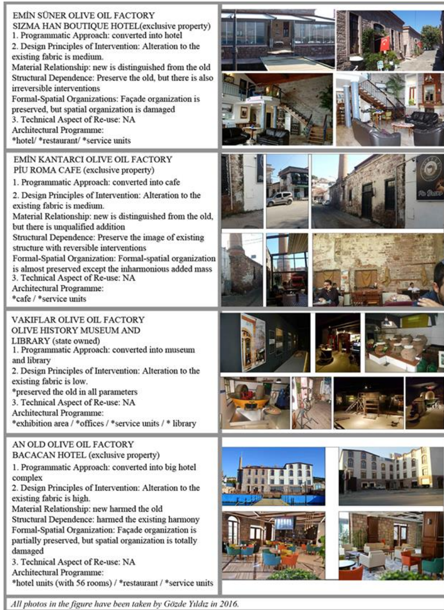
Figure 2: Selected Ayvalık Adaptive Re-use Examples for the evaluation of the site within the scope of the study.

From the programmatic point of view, it can be said that most of the examples make a contribution to the site in order to provide the sustainability. Moreover, the intention of giving the museum example (Formerly, Vakıflar Olive-Oil Factory) is to understand the site demands towards developing a conservation approach for Ertem Olive Oil Factory. Because, while giving a function as museum, the necessity of it for the site should be analyzed. Thus, in Ayvalık, there is a museum of olive history that one can see the production processes, primitive and 19th-century processing tools, information about family enterprises. In addition to Olive History Museum, there is also Rahmi Koç Museum in Cunda (Formerly, Taxiarchis Church). For their conservation approaches, it can be concluded that the successful ones have the