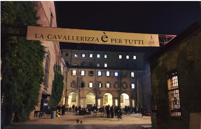
Fig 4. «Cavallerizza is for everybody» at the squat's entrance

Cavallerizza Reale is a building complex located in the city centre of Turin. Its construction started in the Baroque Age as a part of the Savoia's Zona di Comando and is as such part of the UNESCO world heritage site 'Residenze Sabaude'.