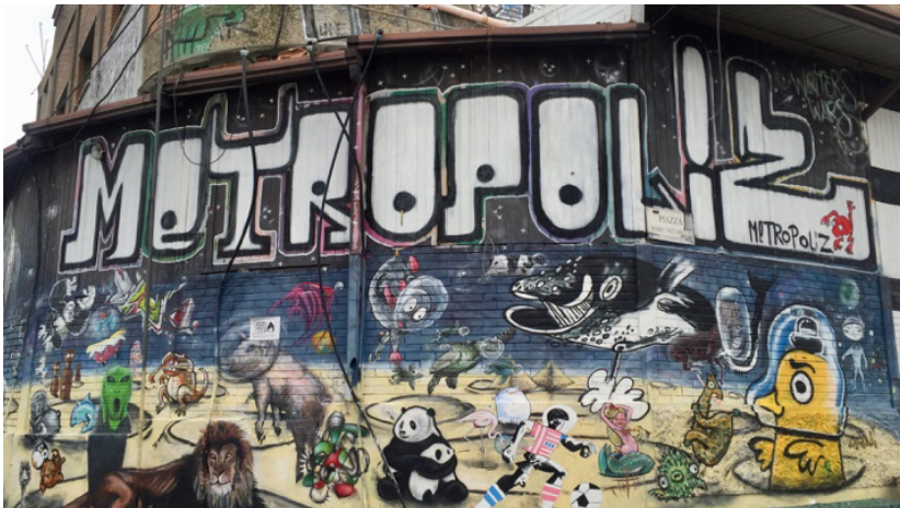
Fig 1. The entrance of Metropoliz